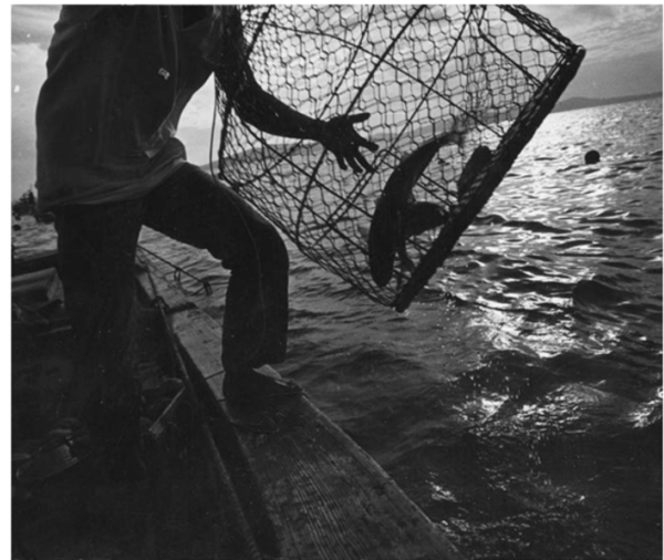
Fishing in Minamata Bay

On 22 March 2011, an exhausting court battle finally ended for over 2000 victims of mercury poisoning in Kumamoto and Kagoshima prefectures. In sum, the agreement, decades in the making, was as follows as outlines in the Japan Times (31 March): “Chisso will provide some 90 percent of the plaintiffs with a ¥2.1 million lump sum each as well as a ¥2.29 billion fund, and the central and prefectural governments will shoulder part of their medical costs.” Chisso Corporation’s dumping of methyl-mercury in nearby waters caused Minamata disease, as the painful ailment came to be known after it was first recognized in 1956. Half a century later, time is running out for these victims to receive the official recognition they deserve, as their bodies are growing increasingly frail. The mercury that poisoned their bodies was carried through the fish they ate and accumulated as it moved up the trophic tiers in a process called biomagnifications. In this process persistent poisons, such as mercury, concentrate in the upper echelons of the food chain. In biomagnification, organisms at the top of the chain carry higher levels of toxicity in their fatty tissues.