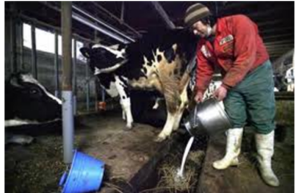
Fukushima dairy farmer disposes of milk

Fukushima and Ibaragi prefectures were also asked to halt milk shipments because of fear of contamination. One farmer pumping milk from his cow directly into the drain, as one of his cows seemed to peer over his shoulder, lamented that he must “throw away milk like garbage.”