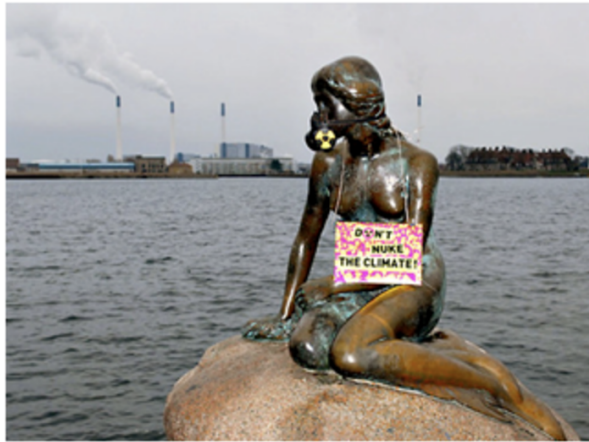
Photomontage: Outside the TEPCO plant in Fukushima

While numerical data is occasionally released detailing the amounts of iodine-131 and cesium-137 in the soil of Fukushima, in the sea water off of the Fukushima plant, in the drinking water in Tokyo pipes, in the leafy greens of Miyagi Prefecture, in the milk from Iwate, or on the sides of planes flying across the Pacific, the short and long term environmental consequences of these radioisotopes is far from clear. As with methylmercury a half century ago, Japan is once again threatened by a new persistent toxin accumulating in its food and water. But unlike the early days of the discovery of mercury poisoning, Japan's government has quickly launched responses to this contamination, even far beyond the local site of contamination.