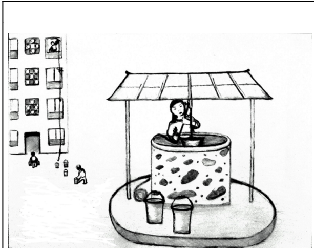
The Well 2: Life in North Korea. Drawing by a "repatriate refugee" of women and children hauling water to the top of an apartment block

of Foreign Affairs was secretly sharing this information with allied governments (including the United Kingdom) but despite this knowledge (as far as I can determine) took no steps to reassess the future of the repatriation scheme. 76