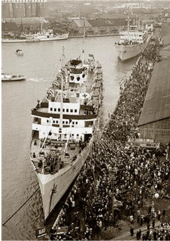
Repatriation ship prepares to depart Niigata Port

Throughout 1956 and 1957 the repatriation issue was indeed among the most significant projects taken up by senior Japanese Red Cross and ICRC officials. The steps they took to create the basis of a repatriation project were many and complex, and here I shall just very briefly highlight some of the most significant: