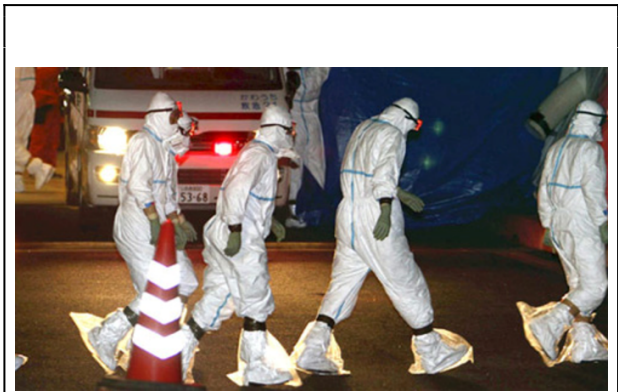
Radiation protective uniforms but not boots. Two TEPCO workers were hospitalized after stepping in radioactive water.

As early as the mid-1970s, the use of subcontracting labor in the nuclear industry was well established in Japan. In France, this trend would develop after 1988, reaching a rate of 80% by 1992. According to NISA’s data, in 2009, Japan’s nuclear industry recruited more than 80,000 contract workers against 10,000 regular employees. The initial goal was not necessarily to hide the collective dose, but to limit labor costs. But the fact is that whether in France or Japan, the nuclear industry nurtures a heavy culture of secrecy concerning the number of irradiated workers. As far as we can know, based on the figures published by the Ministry of Health and Labor, before Fukushima’s catastrophe, only 9 former workers received compensation for an occupational cancer linked to their intervention in nuclear plants. 5 This number is probably very far from the reality of the victims, given the number of workers exposed, and the numerous opacities of that system beginning with the fact that TEPCO and other electric power companies have always refused to disclose the list of their subcontractors.