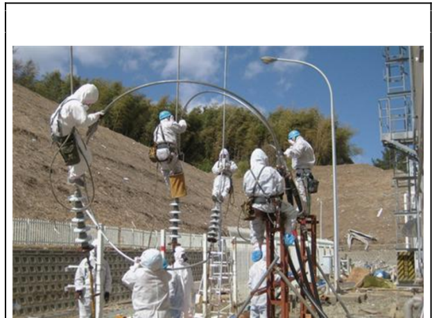
Contract workers doing repairs

Those who answer these offers may have little awareness of the dangers and they are likely to have few other job opportunities. $122 an hour is hardly a king's ransom given the risk of cancer from high radiation levels. But TEPCO and NISA keep diffusing their usual propaganda to minimize the radiation risks.