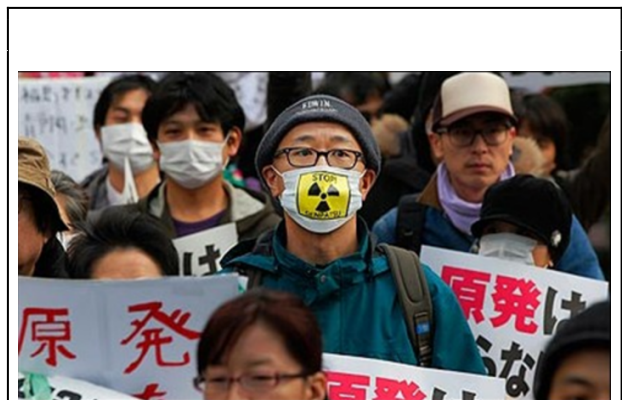
Protestors demonstrated against nuclear power in Tokyo on Sunday, as officials admitted the crisis at the Fukushima Daiichi nuclear plant could take 'months or years' to be resolved.