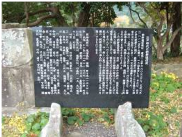
A stone monument for Korean embassies to Japan during the Edo period in Tsushima. The bilingual explanation board says that the Korean visits brought Japan sophisticated knowledge, art and