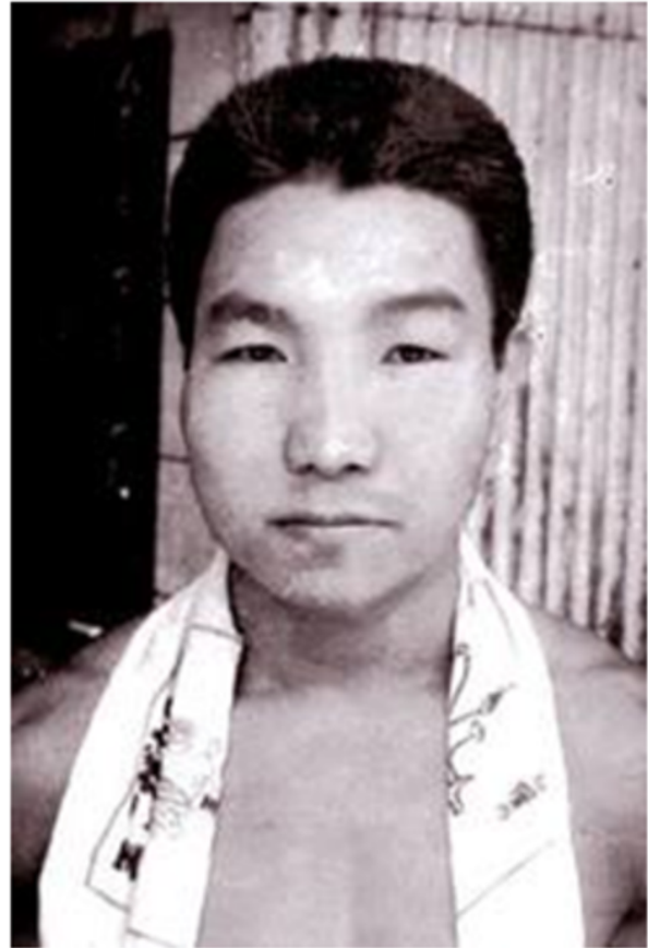
Hakamada in his boxing days

The problem of railroading suspects is explored in Box Hakamada Jiken (2010), a film that dramatizes the saga of Hakamada Iwao, a former pro boxer, who was found guilty of stabbing a family of four to death in 1966. He has been on death row since 1968, and two appeals have failed while petitions for retrial have been rejected three times, most recently in 2008. The film focuses on the intimidating and relentless interrogations by the police in extracting a confession and also exposes flaws in the physical evidence. This was a case full of holes: the bloody clothes prosecutors claim he wore during the murder didn't fit, the knife the prosecutors said he used was too small to inflict the wounds and showed no signs of any damage that would normally occur if actually used in multiple stabbings; there were forty stab wounds on the four victims. In addition, the film alleges that police planted evidence to salvage the conviction after one of the judges raised questions about the veracity and voluntariness of the confession. Hakamada recanted his confession during his trial, claiming innocence and accusing the police of coercion. Hakamada said he never read the confession, but, "I wanted silence and had a headache so just wrote down my name and put my head down on the table."