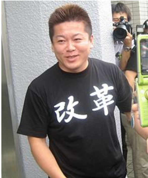
Horie in 2005

Horie maintains, "Ezoe was targeted when he rose to the highest point of his career. So was I. The prosecutors like to do such a thing (to show off their power)." 31