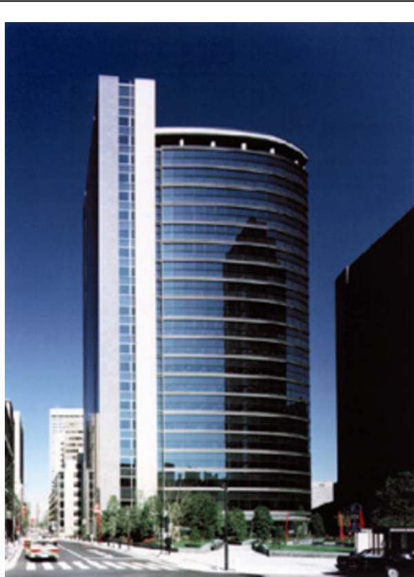
Tepco's Shinsaiwashi Building

As noted, TEPCO is the utility that owns and runs the stricken reactors. It is the fourth largest utility in the world, Asia's largest, with total assets (in fiscal 2009) of YEN 12.6 trillion and gross income of YEN 4.8 trillion. With 280.2 terrawatts of electricity sales (again for fiscal 2009), TEPCO dominates fully one-third of the enormous, 858.5 terrawatt Japanese power market. Forty percent of TEPCO's power is generated by nuclear plants, and the firm champions the world's largest nuclear power building programme. TEPCO's losses are going to be enormous as a result of this crisis, and its shares have already plunged from the pre-crisis 2300 level to about 900 as of March 18th. Losses might even extend beyond yet more financial costs on its book and the accounts of the state. Certainly TEPCO confronts the threat of being displaced from its perch, losing its immense nest of concentrated benefits. The utility has staked its corporate reputation on being able to deliver power, uninterruptedly