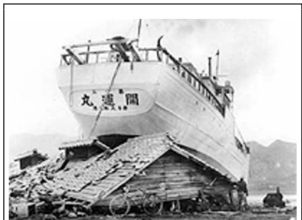
It took nearly 24 hours for tsunami waves created by the Chilean earthquake of 1960 to reach the Japanese coast.

e360: It originated in roughly the same area as the recent tsunami?