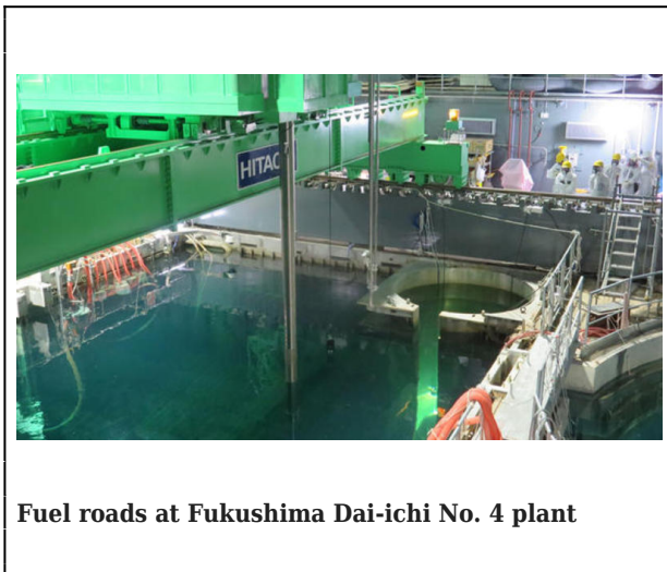
Fuel roads at Fukushima Dai-ichi No. 4 plant

Problems at the plant have continued well after the crisis ended. There have been persistent reports of serious problems with working conditions, with complaints about ‘working in the stifling protective gear, the relatively low pay, loneliness - and stress’. 27 These issues are significant not only because the wellbeing of these people matters, but also because they are engaged in vital work. Exhaustion or stress could lead to human error, misconduct or even sabotage. There have been instances of contaminated water leaking due to mistakes made by workers, leading one former employee to warn that similar problems may reoccur ‘unless the working environment and working conditions improve’. 28 In this regard, it is a matter of concern that a government official involved in the management of the contaminated water at Dai-ichi has recently observed that working conditions at the plant are ‘no better’. 29 The on-going problems at Dai-ichi do not inspire much confidence that TEPCO or any of the other utilities will foster the kind of workplace in which safety culture is prioritized.