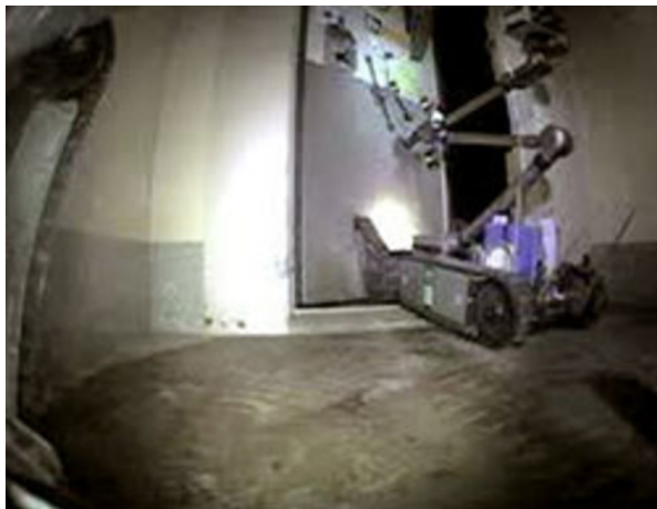
Packman: A PackBot, U.S.-made remote-controlled machine, opens a door to the main reactor building of unit 2 at the Fukushima No. 1 nuclear plant on April 18.

On March 17, six days after the crisis erupted at the Fukushima No. 1 nuclear power plant, a list was presented to Washington through diplomatic channels seeking U.S. assistance.