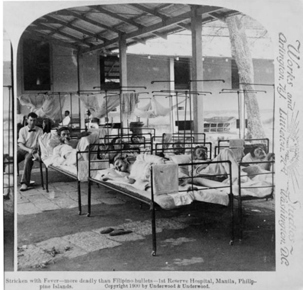
Stricken with Fever—more deadly than Filipino bullets—1st Reserve Hospital, Manila, Philippine Islands.