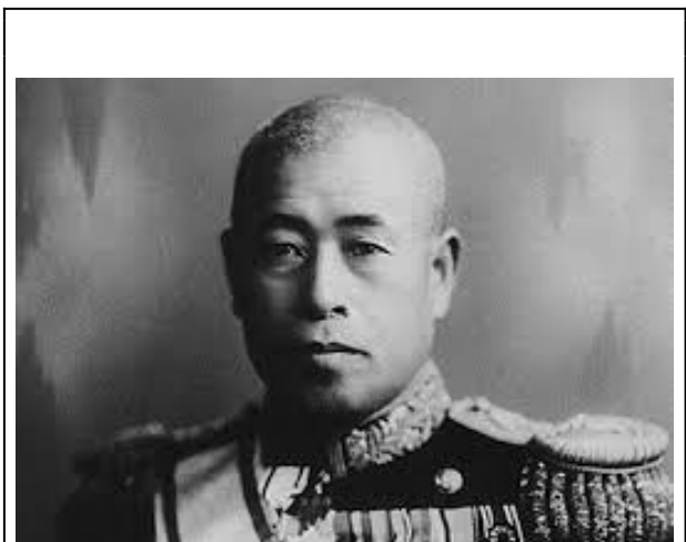
Admiral Yamamoto Isoroku.

These two battles had the long-term effect of ruining the navy. That is to say, the navy forgot to use this time to take stock of itself. This resulted in a failure to appreciate the importance of improving its weaponry and staying abreast of the times. I recall having read somewhere that Admiral Yamamoto Isoroku [1884-1943], commander of the Combined Fleet, once told the emperor: "The Japanese Navy will take the Pacific by storm." What an utterly stupid thing to say! With commanders like him no wonder we didn't stand a chance.