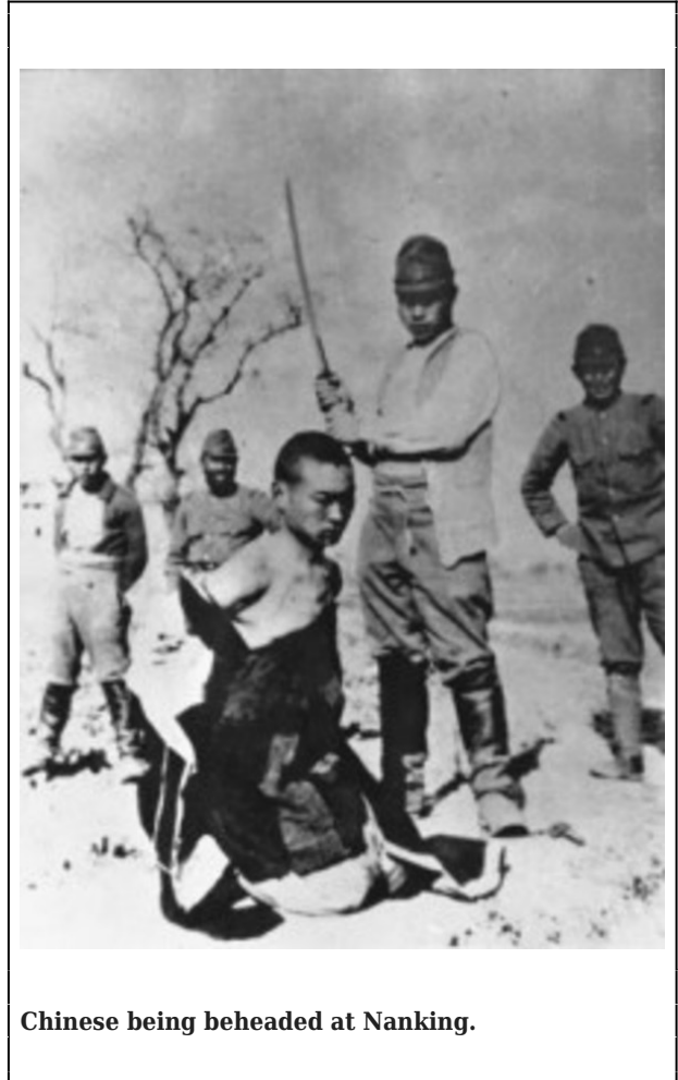
Chinese being beheaded at Nanking.