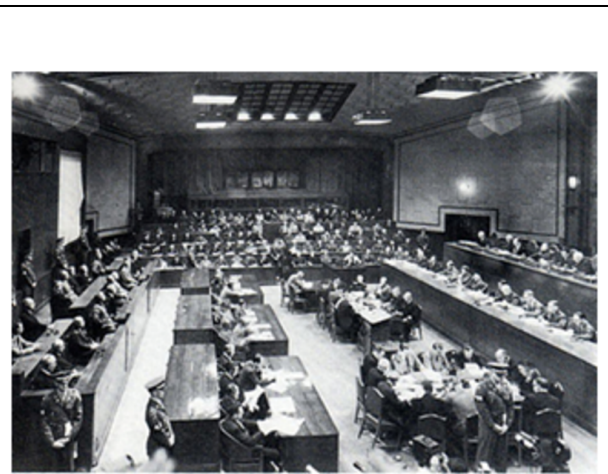
Tokyo Trial: Judges (left), Defendants (right) and Prosecutors (rear)

perceptions are examined through popular reactions to the Tokyo Trial itself, as well as related events and movements within society — including films, symposiums, historical controversies, the rise of neo-nationalism, the Yasukuni Shrine row — and public and media responses to them. 4