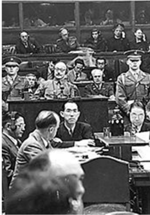
Tōjō center during Tokyo Trial

To what extent the Tokyo Trial actually shaped the Japanese sense of history is difficult to tell, as a sense of history is not as simple as to be shaped exclusively by one trial. Above all, the Tokyo Trial itself has not been visible enough in public discourse to be connected to the majority's view of history. Still, the neo-nationalist movements show one aspect of the Trial's long-term impact on the Japanese sense of history. Discourses surrounding the Tokyo Trial in the 1990s show that the Trial continues to be strongly related to how some see the character of the war, which is still emotionally debated. The characterisation of the war is not necessarily settled in contemporary Japan and newspapers still conduct opinion polls asking how to characterise the 'past war': aggression, self-defence, or a mix of both elements. 61 What is more, there is not yet an official term for the