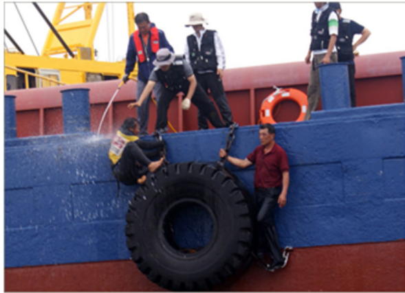
Protesting sea dredging, June 20, 2011