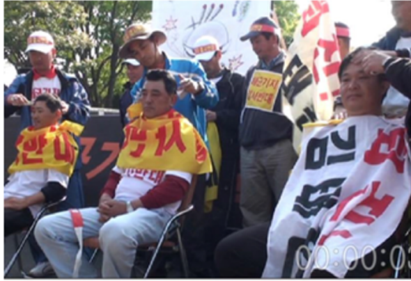
Ritual of shaving heads, April 21, 2009

Especially they twice organized a ‘peace festival’ to send peace messages to everyone concerned and to energize themselves with various performances. In turn, these experiences strengthened their collective identity with a pride of custodianship of their own village as well as of advocates for democracy and peace.