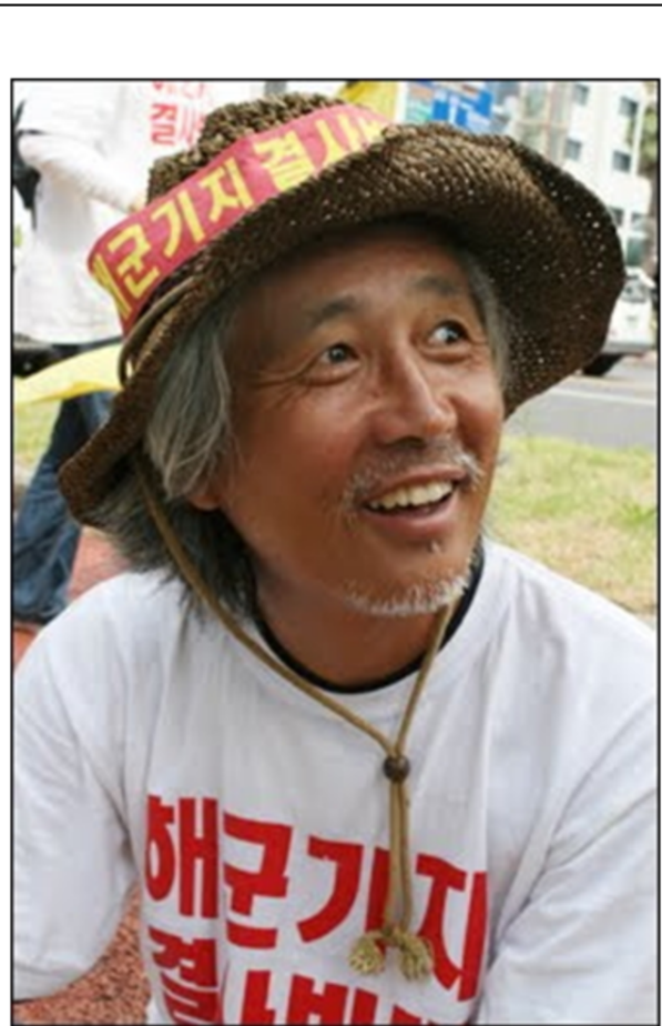
Yang Yoon-moo is widely recognized as Korea's most prominent film critic

In addition, the film shows his forcible arrest by police on April 6, 2011. Following his arrest he maintained a hunger strike for 71 days including 57 days in prison. Why did he (and fellow residents of Gangjeong village) conclude that have no other choice than to risk their lives to prevent the construction of a base?