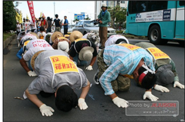
Ritual protest: three steps and one deep bow

extreme trauma in Jeju society in the years 1948-53. The protestors attributed this tragedy to the undemocratic administration and the dividing strategy of the power holders.