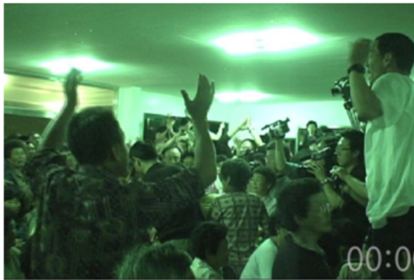
Demanding a “Vote” for residents, June 19, 2007

To legitimate the cause, they created nonviolent rituals such as an art festival, a movement to collect signatures, a one-man relay protest, the presentation of petitions, and shaving heads. 11