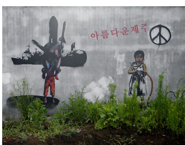
Gillchun Koh graffiti art, Gangjeong

The villagers have two demands: stop construction and initiate a new assessment process to determine the necessity for the base; provide a thorough environmental impact statement (EIS) in accord with Korean law.