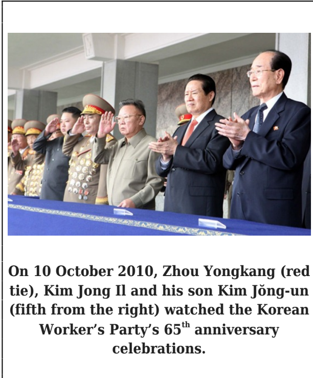
On 10 October 2010, Zhou Yongkang (red tie), Kim Jong Il and his son Kim Jǒng-un (fifth from the right) watched the Korean Worker’s Party’s 65 th anniversary celebrations.

revolutionaries of elder generation... 35