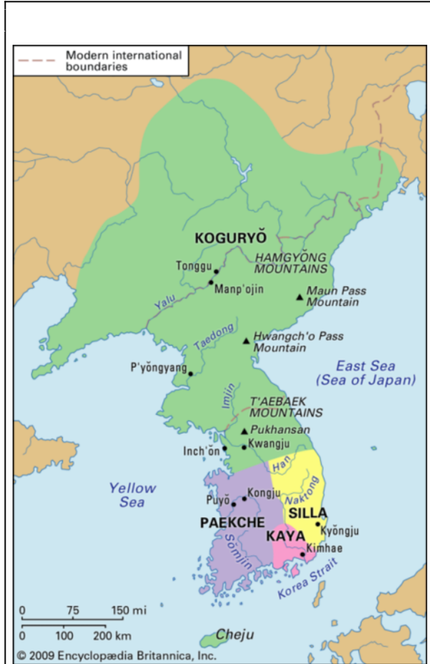
Map of the Three Kingdoms (300 AD-700AD)

publication of a provincial research center dealing with events some two thousand years ago.” 14