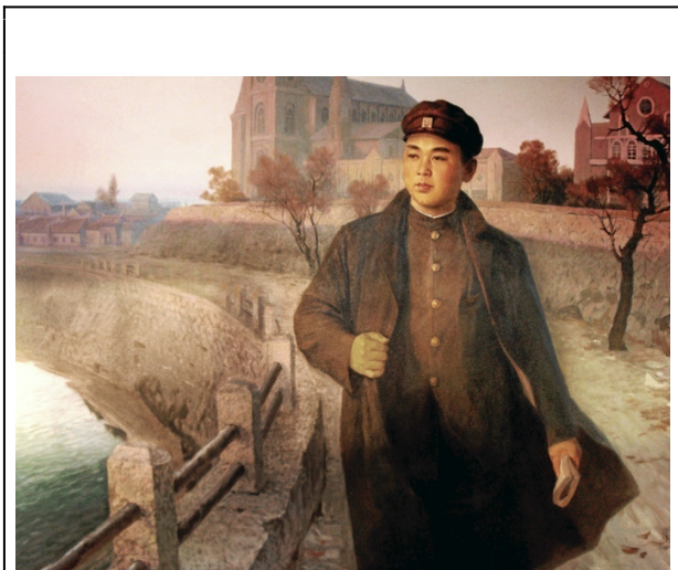
This portrait of a young man was photographed by a Canadian tourist in 2010 and bears a striking resemblance to Kim Jong-un in a setting and layout that is similar to depictions of the young Kim Il Sung. Many North Korea experts believe that the portrait marks the first glimpse of how the North Korean regime plans to “sell” the heir apparent to the public. 38

plastic surgery to look more like his grandfather. 36 Also telling was the decision to introduce the heir apparent at the 65 th anniversary of the North Korean Workers Party on 10 October 2010. On the reviewing stand with Kim Jong-un and his father was Zhou Yongkang, China’s new point man in North Korea who is helping to oversee the Northeast Project. 37