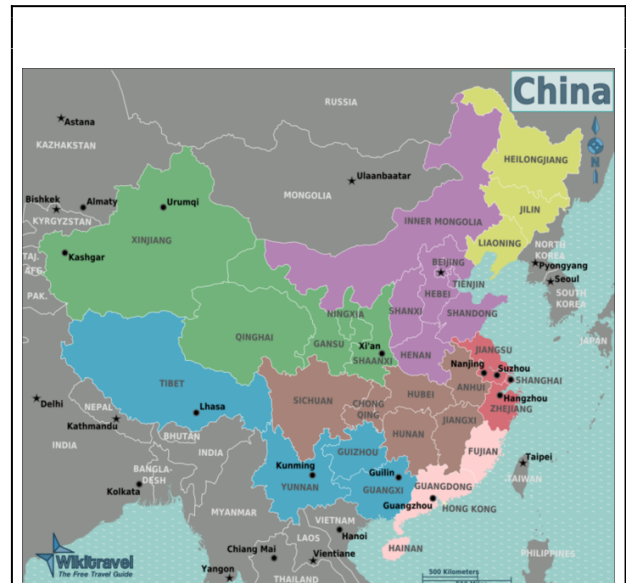
Heilongjiang, Jilin and Liaoning Provinces and North Korea.

Beyond this bickering over history, however, the political ramifications of the dispute have been far-reaching. By claiming Koguryŏ as part of China’s ancient past, South Koreans asserted the Chinese government was undermining the legitimacy and political authority of North Korea whose territory was once part of Koguryŏ.