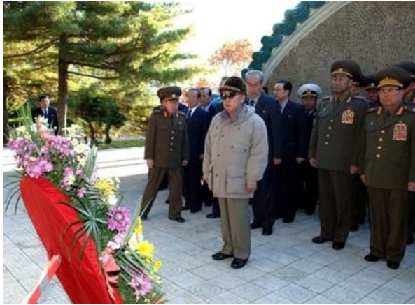
Kim Jong Il, center, laid a wreath in front of the grave of Mao Anying, Mao Zedong's son who died in the war, 26 October 2010.

Even then, China's role in the war is construed as being one of "reciprocal obligation" since North Korea had once aided the Chinese in their war against Japan. "The tradition of ties of friendship between the peoples of the DPRK and China, sealed in blood in the joint struggle against U.S. and Japanese imperialisms, the two formidable enemies, has steadily developed on the basis of particularly comradely trust and sense of revolutionary obligation of the leaders of the elder generation of the two countries" explained the Nodong sinmun , the North Korean party daily. 33 In short, by equating China's aid against American "imperialists" in the Korean War with the aid of Korean revolutionaries in fighting Japan in China during World War II, North Korean officials drew attention to equality of revolutionary comrades-in-arms based on the bonds of DPRK-China friendship "sealed in blood" rather than any indication of super-power "dependence." As stated in the Nodong Sinmun :