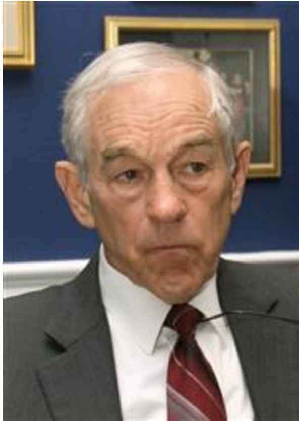
Republican Congressman Ron Paul, in an interview with Kyodo News Agency in mid-February, 2011, dismissed the view of U.S. forces in Japan serving as a deterrent, calling it an excuse to maintain U.S. military forces in the region.

In July, Frank and Paul wrote an article ‘Why We Must Reduce Military Spending’ for the Huffington Post , the influential political website. In it they explained that 2010 military spending was about $693 billion, over 42% of total government spending, and this is damaging the US economy and reducing people’s quality of life. They also pointed out that US intervention in other countries as a superpower often generates anger directed at the US, and concluded that ‘rebuilding our economy and creating jobs remains the nation’s top priority. It is essential that we begin to address the issue of excessive military