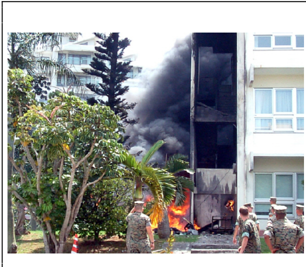
A USMC helicopter crashed into Okinawa International University campus on August 13, 2004.

US government in a very difficult position. Closing down risky Futenma as soon as possible and restoring the unstable Japan-US relationship must surely suit US national interests. If Japan adheres to the existing logic - not to mention its Chief Cabinet Secretary asking Okinawa to accept the burden of the bases - Japan will not find a solution to the Futenma problem. It deserves to be criticised for its sycophantic diplomacy following the US. Fourteen years after the agreement to return Futenma base land to the people, with absolutely no progress, the situation is ripe for change. If we link the new defense trends in the US with the 'all-Okinawa' opposition to relocation inside the prefecture, it is natural to conclude that it is time for reconsideration of the Futenma problem.