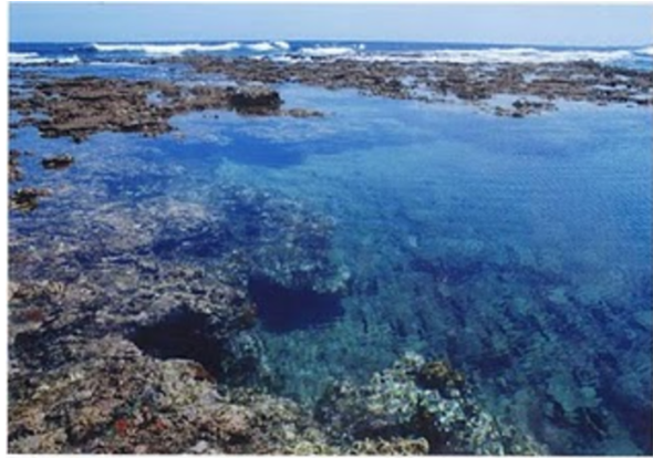
Pristine water off Henoko

As the US faces a financial crisis with no sign of recovery, and a number of difficult related issues, the trend of domestically-oriented policies and national consciousness will continue to accelerate. Even the Republican Party, which believes that a large defense budget is the barometer of state power, and which opposes defense budget cuts, has to accept that there is no such a thing as a 'sacrosanct' sector these days. If the inward-looking philosophy that 'money should be spent only on our own country' spreads further, overseas military forces will undoubtedly become a target to rationalise. Voices calling for 'abolishing overseas forces' have emerged even from within extremely conservative Tea Party groups that influenced recent midterm elections.