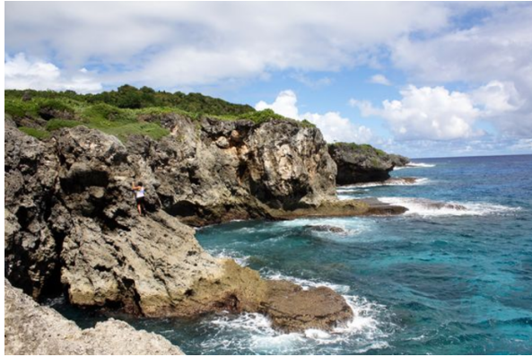
The coastal Pagat archaeological site, Guam's valuable cultural site

Prior to this, relevant congressional committees approved cutting the cost of relocation by 70 percent. With operations not progressing according to US government plan, the plan itself is now being questioned. Committee reports have severely criticised the government, stating: 'Guam's water and waste water facilities, electrical system, roads and other infrastructure are already inadequate. There is no consideration of the environment' (US Senate Appropriations Committee); 'It is a serious concern when and how the DoD will respond to the poor evaluation it received regarding the environmental impact of the Guam construction plan. They have not addressed its impact on residents either' (House Committee on Appropriations).