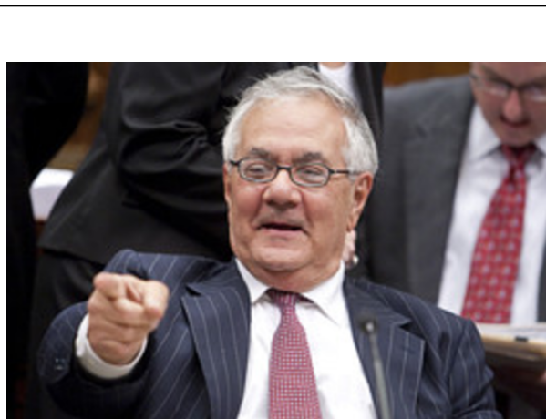
Democrat Congressman Barney Frank, frequently cites Okinawa as “prime exhibit” of what he considers “wasteful WWII legacy spending.”

In Washington, more voices are demanding cuts in military spending. In May, a non-partisan group of congressional representatives, convened by Democrat Barney Frank, and Republican Ron Paul, formed the ‘Sustainable Defense Task Force’ (SDTF). Together with some military specialists, they closely scrutinised military spending and concluded that it was possible to cut 1 trillion dollars in spending over the next 10 years by reducing US Forces stationed in Europe and Asia, and by not pursuing contracts for military airplanes such as the MV-22 Osprey.