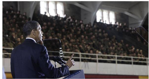
Barack Obama, announcing his decision to withdraw combat forces from Iraq at Camp Lejeune, N.C., on February 27, 2009

On August 31, President Obama delivered a speech from the White House. Because he was expected to declare the end of the Iraqi war, the entire nation focused its attention on the content to the speech. 'Operation Iraqi Freedom is over. ... We have spent over a trillion dollars on this war, often financed by borrowing from overseas. This, in turn, has short-changed investments in our own people, and contributed to record deficits.... Our most urgent task is to restore our economy, and put the millions of Americans who have lost their jobs back to work'. It marked the beginning of a new era, and under other circumstances this speech would have impressed people. The president, however looked troubled, and the atmosphere was gloomy - hardly the context for a forward-looking policy announcement; this was largely due to the severity of the economic crisis the US currently faces.