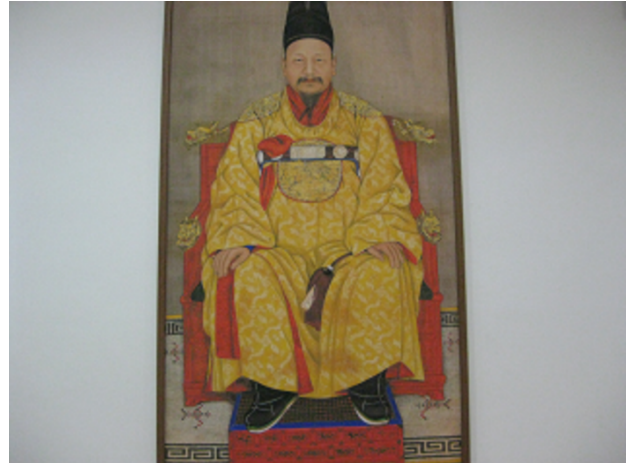
Emperor Kojong refused to sign the 1905 Protectorate Treaty. Photo by the author, August 2010 at Jungmyeongjeon

"Japan sent its elder statesman, Ito Hirobumi, to conclude the protectorate treaty. Ito entered the palace with an escort of Japanese troops, threatened Emperor Kojong and his ministers, and demanded that they accept the draft treaty which Japan had prepared. When the Korean officials refused, Prime Minister Han Kyu-sol, who had expressed the strongest opposition, was dragged from the chamber by Japanese gendarmes.