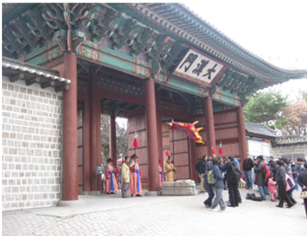
Deoksugung palace (formerly Gyeongungung): Japan sent its elder statesman, Ito Hirobumi, to conclude the protectorate treaty. On 17 November 1905, Ito entered the palace with an escort of Japanese troops, threatened Emperor Kojong and his ministers, and demanded that they accept the draft Protectorate treaty which Japan had prepared. Photo by the author, August 2010.