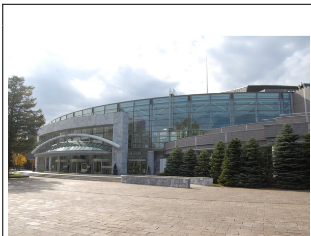
Kitara Concert Hall, Sapporo

Kitara is Sapporo's state-of-the-art concert hall in the middle of picturesque Nakajima Park. On 2 July 2014 I went there with different expectations than usual. I was not going to hear a professional orchestra playing a masterpiece of the classical repertoire, but an amateur choir singing a little-known choral work called Akuma no Hōshoku ( The Devil's Gluttony ), composed by Ikebe Shinichiro with words by Morimura Seiichi, a leading novelist. The piece was about Unit 731, Japan's infamous chemical and biological warfare unit located near Harbin in northeastern China (Manchukuo) in the years 1934-45, which murdered 3,000 people in gruesome vivisections and medical experiments.