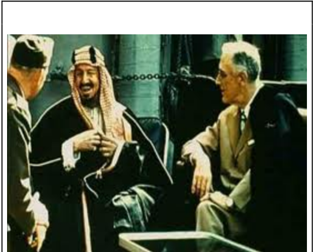
King Saud and Roosevelt, 1945

During World War II, the U.S. moved decisively to secure the oil fields of Saudi Arabia and transfer the desert kingdom from the British sphere of influence to one of hegemony by the U.S. and American oil corporations. President Franklin D. Roosevelt entered into a collaboration with the reactionary King Ibn Saud—a “lethal embrace” that his successors, Truman and Eisenhower but also Johnson and Nixon, steadily developed. 1 Through the machinations of the CIA, Iran and the oil-producing countries in the Persian Gulf region came under Washington’s protection.