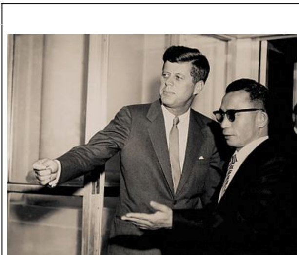
Park and John F. Kennedy

Under Syngman Rhee (1948-60), South Korea lacked a strong independent indigenous capitalist class and allowed few civil freedoms. Under Gen. Park Chung Hee (1961-79), Seoul provided the largest complement of mercenary troops to support the U.S. war in Vietnam. No less important, starting in the Park years South Korea experienced rapid, export-led industrialization and undertook major political and economic reforms. Its capitalist and financial class grew large and autonomous despite being hampered by the heavy weight of the military. (In 2010 South Korea had 653,000 active forces and 3.2 million regular reserves, far larger than Egypt's military. 9 ) Korean capitalists too benefited from the dual economic assistance of Washington and Tokyo.