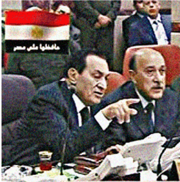
Mubarak (left) and Suleiman

Suleiman allowed military police to attack journalists and human rights workers and bears responsibility for the deaths of over 300 demonstrators and the imprisonment and disappearances of unknown thousands. When he took over from Mubarak, Sec. of State Hilary Clinton and Frank Wisner, Jr. her special envoy to Cairo, initially let it be known that Washington supports Mubarak. Finally, on the 18 th day of protests, after workers had staged strikes throughout the country and millions of Egyptians had called for the end of the regime, Mubarak stepped down. This opened the present interlude of freedom and negotiation while still leaving the military in charge and the foundation of military rule intact.