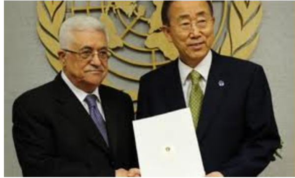
Palestinian President Mammoud Abbas with UN Secretary General Ban Ki-moon

Since then, however, there has been a backlash against the extreme anti-Islam policy of the United States in the form of an anti-U.S., anti-Israel Islamist movement; since the revolution in Egypt last spring, Islamism has been accelerating under the rubric of democratization. Previously pro-Israel Egypt and Turkey have since turned anti-Israel, and the Palestinian Authority, once a puppet of the U.S. and Israel, is increasingly defiant in its attempt to gain United Nations membership. Even in formerly secular Tunisia and Morocco, the Islamists are rising in the elections .