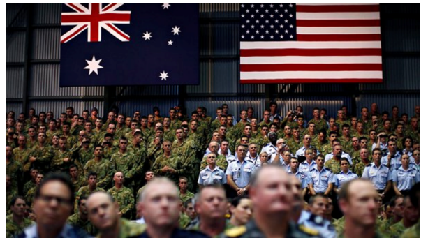
American Marines and Australia Soldiers listen to Obama address in Darwin, Australia

In his remarks to the Australian parliament on November 17, President Obama declared that the U. S. was making the Asia-Pacific region a top priority. While promising a continued U.S. military presence in the region, Obama also expressed his intention to strengthen U.S.-China cooperation. This declaration, however, was made at the same time as Obama announced a series of anti-China measures: to station U.S. forces permanently in Australia for the first time, to promote the Trans-Pacific Partnership (TPP) - a multilateral trade agreement that excludes China - and to discuss the South China Sea Islands at the ASEAN summit, to Beijing’s displeasure. Therefore, the Japanese media view Obama’s emphasis on Asia as strengthening an anti-China containment ring.