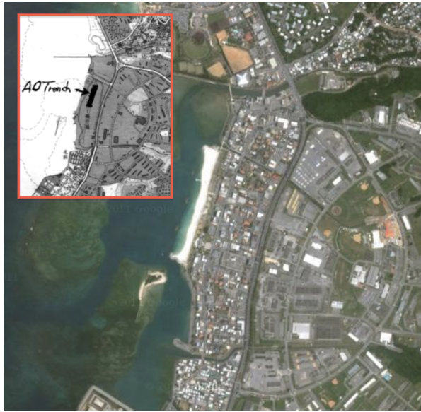
The area identified by the former US soldier is now a mixed residential/business neighborhood in Chatan Town, Okinawa.

The veteran explained that such disposal of damaged or unwanted supplies was commonplace by the military on Okinawa. “The Army was just doing what it always did,” alleges the veteran. “They buried those barrels because it cost less than shipping them all back to the States. It was cheaper that way.”