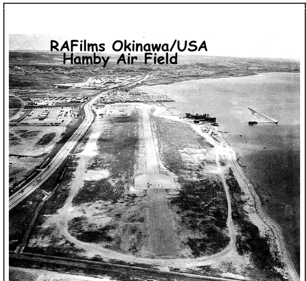
Hamby Air Field at the time the barrels were allegedly buried

“As soon as I saw the long pier on that map, I knew exactly where they buried the Agent Orange. I used to go fishing from the pier all the time. Seeing it made it simple for me to find the site. There is no doubt in my mind,” said the veteran.