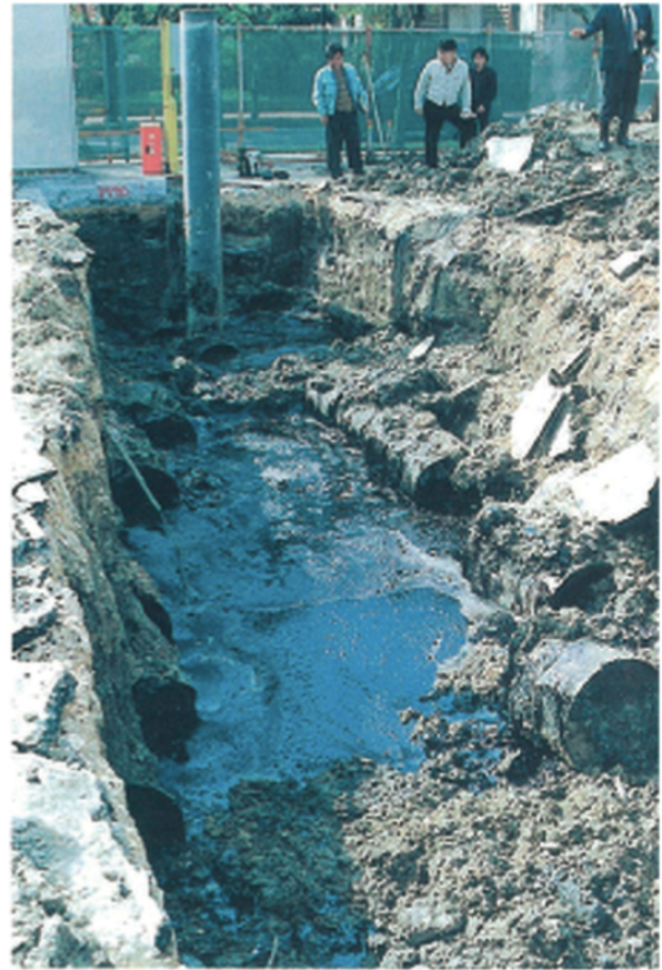
In 2002, over 200 barrels of unidentified US military waste were discovered in Chatan near the alleged Agent Orange burial site.

These latest allegations of the burial of Agent Orange on Okinawa are not the first time that Washington has been suspected of disposing toxic chemicals in the Chatan area. In 2002, 215 barrels of an unidentified substance were unearthed on formerly US-owned land approximately 750 meters from where the former soldier is now alleging Agent Orange was buried. 9