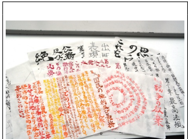
This artwork appeared in an exhibition entitled "the Constitution and Peace" which opened in a public art space in Fukui Prefecture in May. The work consists of several sections of the current constitution written out in attractive calligraphy and coloured ink on Japanese paper. Soon after the exhibition opened, it was removed on the orders of the company which manages the art space for the local government on the grounds that "its political content might offend the feelings of some viewers".

happiness”. The revised constitution prepared by the Liberal Democratic Party contains no guidelines as to how, and by whom, “public interest” and “public order” would be defined, leaving an alarmingly large loophole for the repression of civic freedoms by the state. A new article would also be added to the constitution to give the state sweeping powers to declare prolonged states of emergency, during which constitutional rights could be suspended. 22 With the prospect of an LDP super-majority in parliament for the next two to three years, there is a strong likelihood that the ruling party will push forward with an attempt to carry out these changes: changes so profound that they should probably be described, not as plans for constitutional revision, but rather as plans for a new constitution.