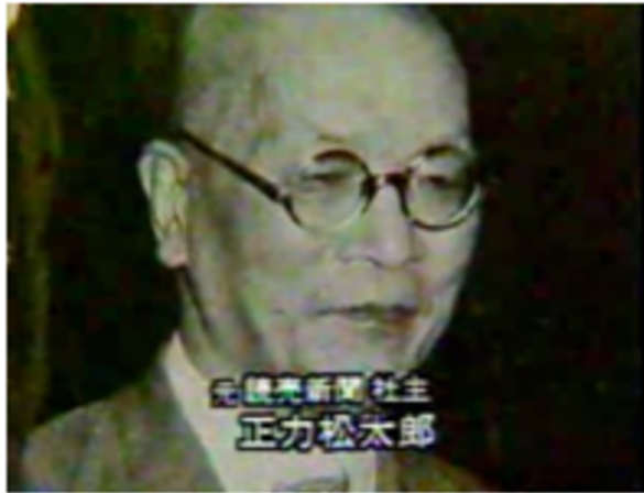
Shoriki Matsutaro (1885 - 1969)

Shoriki began working with the CIA after the war and supported Japan's possession of nuclear weapons as a member of the US Cold War alliance against the Soviet Union. To this end he promoted the "peaceful use of atomic energy," utilizing his media companies to build support in Japan. Shoriki and others in the pro-military camp calculated that research in nuclear energy would lead, in the future, to Japan's development and possession of nuclear weapons. 1