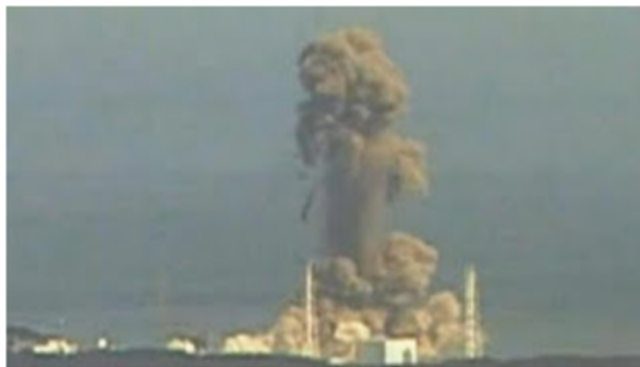
Explosion at No.3 Reactor of Fukushima Daiichi, March 14, 2011

At midnight on April 22, 2011, the Japanese government designated the zone within a 20-kilometer radius of the Fukushima nuclear power plant a controlled area under the Basic Law for Disaster Countermeasures. As a result, all entry into the zone was prohibited without special government permission. Some 78,000 people were separated from their homes, without knowing when they might return.