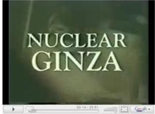
Nuclear Ginza (Channel 4, 1995. LINK to view video )

Another important problem concerns the workers at the nuclear power plants. Most of these workers are irregular employees of TEPCO subsidiaries, referred to as "cooperating companies." Performing jobs with high risk of radiation exposure and other severe working conditions, these workers are not members of Denryoku Soren. Many of them are temporary workers who come from Okinawa, or are drawn from former day laborers from Osaka's Kamagasaki and Tokyo's Sanya districts. Risking their lives to earn even slightly higher wages, these workers engaged in dangerous tasks form the lower stratum in a structure of discrimination, with the pro-company unions stationed above and turning a blind eye to the situation. 7