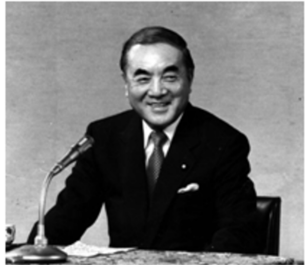
Nakasone Yasuhiro (1918 - )

Another figure was Nakasone Yasuhiro, the former prime minister who carried out the privatization of Japan's national railways. Nakasone had shown interest in nuclear power when he was in the Japanese Navy during the war, and as soon as he became a politician after the war, he delivered a petition on nuclear energy research to the Supreme Commander of the Allied Powers, Gen. Douglas MacArthur. When Nakasone submitted a budget for nuclear energy development to the Diet in 1954, nuclear energy was launched in Japan.