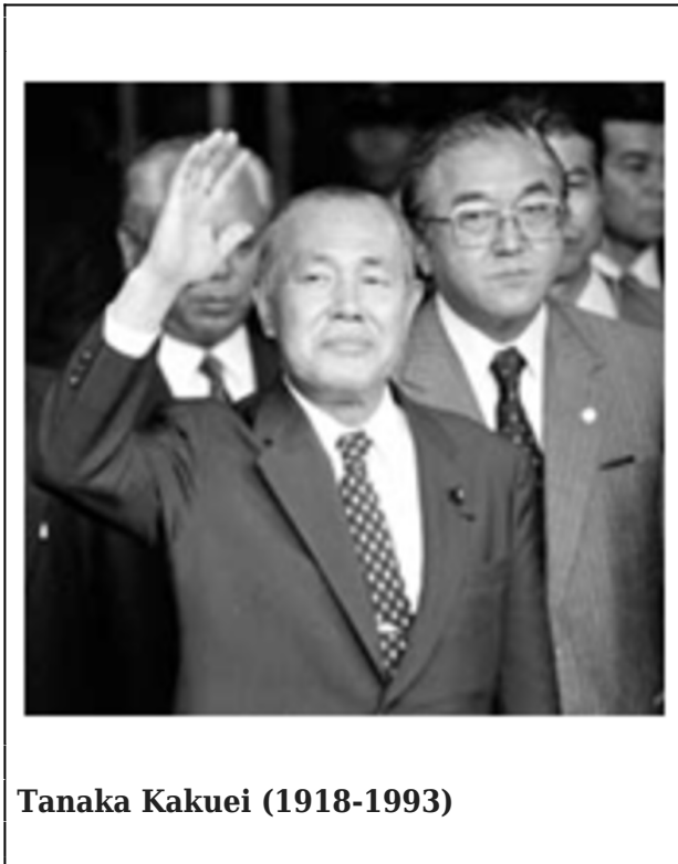
Tanaka Kakuei (1918-1993)

Following in Shoriki and Nakasone's footsteps as the standard bearer for nuclear power was former prime minister Tanaka Kakuei, famed for his Plan for Remodeling the Japanese Archipelago.