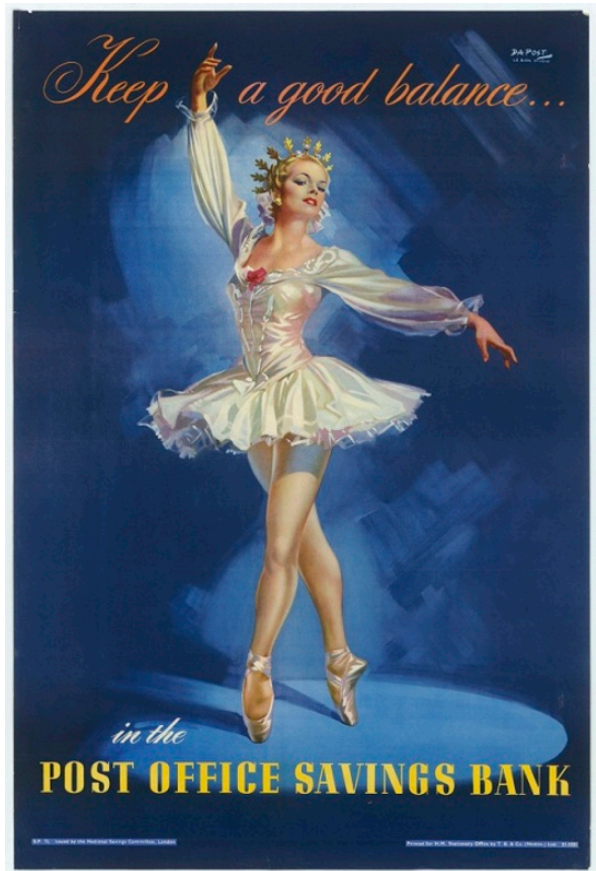
The British poster, (bottom), that inspired the Japanese poster.

Such judgments were influenced by contemporary American critiques of mass consumption, notably Vance Packard’s The Hidden Persuaders (1957) and The Waste Makers (1960). According to Okazaki, The Waste Makers revealed how American industry chronically overproduced for the consumer economy with Packard urging Americans to restore the balance among factors in the economy. Packard’s diagnosis might fit Japan better than the United States, Okazaki ventured, considering how much Japanese squandered on restaurants, clothes, and