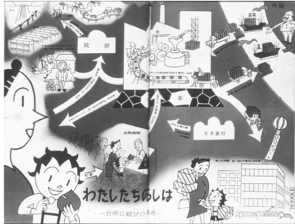
“The Economy as Linked to the Kitchen,” 1962. Aimed at housewives, this cartoon communicates that savings benefit the nation by financing industrial production (center). Although some production results in individual consumption (lower right), a huge portion is shipped abroad to remedy Japan’s trade deficit. The sinister Western tycoon (upper right) personifies “foreign countries,” which send ¥2 trillion in goods to Japan whereas Japanese exports total only ¥1.5 trillion. Yasashi keizai no hanashi [Economics made easy] (Tokyo: Chochiku Zōkyō Chūō Iinkai, 1962), Ministry of Finance, Japan.

Whereas the relation between thrift and environmentalism remained implicit in Europe, the Japanese state successfully fused the causes of saving, economizing, and conservation in the public mind. In 1974 savings-promotion officials played a central role in fashioning the People’s Campaign to Value Resources and Energy. More than one hundred organizations took part representing consumers, women, educators, the media, business, and local governments. Myriad local campaigns harangued the populace to save and economize on goods and energy. Casting their involvement in socially progressive terms, women’s and consumer advocates denounced the recent consumer boom as out of balance with society’s needs for a more generous welfare state and a cleaner environment. The social critic Higuchi Keiko seized upon the Oil Shock as an opportunity for consumers to move