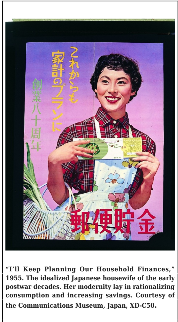
“I’ll Keep Planning Our Household Finances,” 1955. The idealized Japanese housewife of the early postwar decades. Her modernity lay in rationalizing consumption and increasing savings.

The excruciating demands of the account books prompted some women to refuse to keep them. Yet the bigger surprise is how many Japanese women utilized the ledgers more or less as designed. According to official surveys from 1973 to 1984, roughly half of those surveyed who kept accounts replied that they recorded income and expenditures every day. Another one-fifth claimed they itemized expenses daily but calculated balances monthly. The remaining one-quarter budgeted on a monthly basis. 51 Economists have yet to model the impact of household account keeping on saving and economizing. However, if a large proportion of the households systematically monitor spending by means of account books in Society A (Japan) and very few keep such budgets in Society B (say, the United States), wouldn't we expect to see substantial differences in saving rates—all other things being equal?