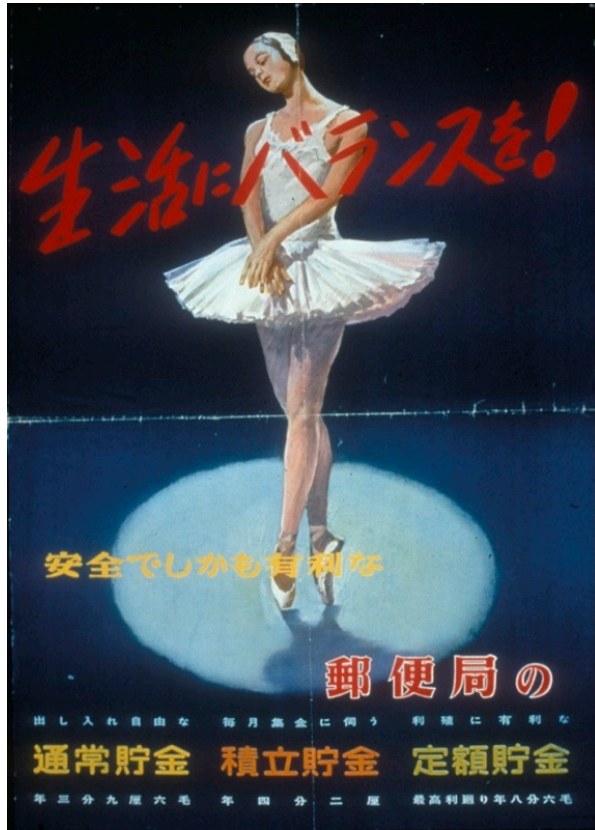
“Keep a Balance in Life,” Japan, 1955 (top). An early version of the Japanese government’s message to balance consumer desires against the needs of accumulating sufficient savings. Courtesy of the Communications Museum, Japan, XD-C52.