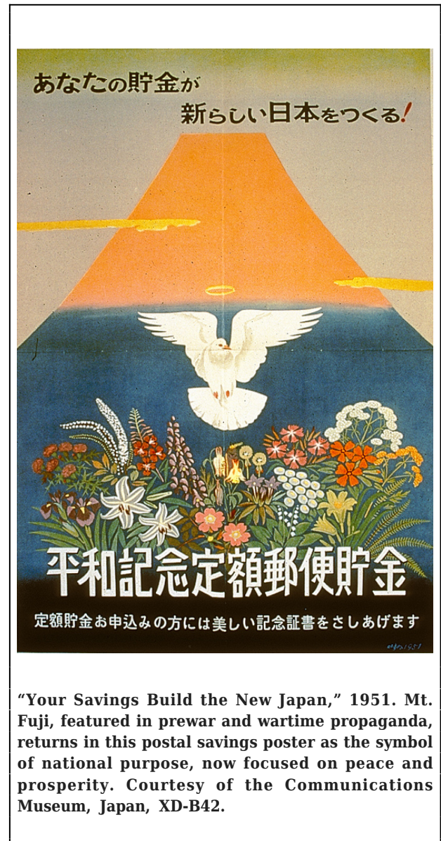
“Your Savings Build the New Japan,” 1951. Mt. Fuji, featured in prewar and wartime propaganda, returns in this postal savings poster as the symbol of national purpose, now focused on peace and prosperity. Courtesy of the Communications Museum, Japan, XD-B42.

savings deposits from 1955 to 1957. In 1963 new legislation permanently exempted interest on small savings accounts of any type. The government kept raising the ceiling on savings exempted from taxes, eventually to ¥3 million per person in 1974.