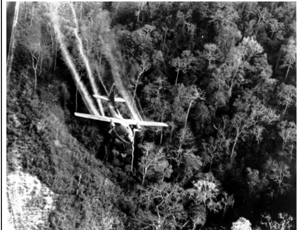
In this May 1966 file photo, a U.S. Air Force C-123 flies low along a South Vietnamese highway spraying defoliants on dense jungle growth beside the road to eliminate ambush sites for the Viet Cong during the Vietnam War.

The high-ranking official's account dovetails with publicly-available records regarding the Pentagon's defoliant tests at this time. During the early 1960s, the US military was still fine-tuning the technology with which it conducted aerial spray missions over south Vietnam as part of Operation Ranch Hand. 5