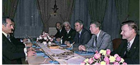
The Shah (left), Brzezinski (right), Carter (second right)

That the U.S. would support al-Qaeda in terrorist atrocities runs wholly counter to impressions created by the U.S. media. Yet this on-going unholy alliance resurrects and builds on the alliance underlying Zbigniew Brzezinski’s 1978-79 strategy of provocation in Afghanistan, at a time when he was President Carter’s National Security Adviser.