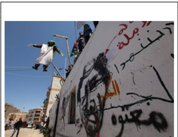
Benghazi group's Gaddafi effigy, May 22, 2011