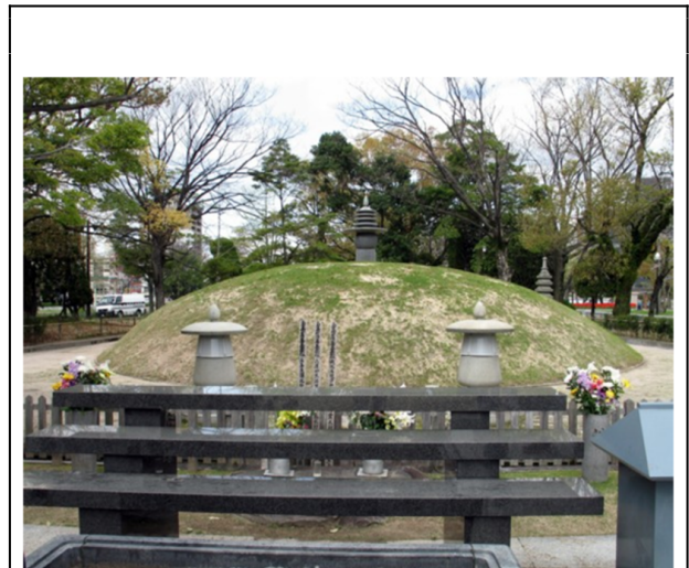
The Memorial Mound, Hiroshima

lush) topped by a small monument that resembles the tip of a pagoda. On one side of the Memorial Mound the gray wooden fence has a gate, and down five steps from the gate is a door. Visitors are usually not allowed through that door, but occasionally the city of Hiroshima honors a request from a foreign journalist.