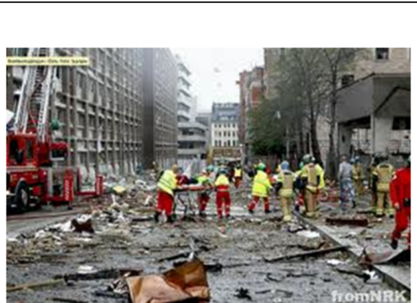
The Oslo bombing