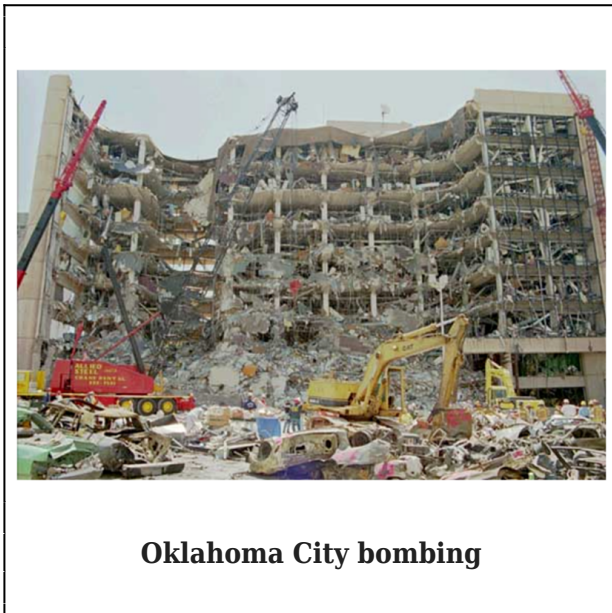
Oklahoma City bombing

Nichols' skill as a terrorist seems to have grown while in the Philippines. Initially he was an unsuccessful bomb-maker. According to Michael Fortier's testimony, Nichols and McVeigh failed miserably when they tested an explosive device in the Arizona desert just six months before they bombed the Murrah building. After Nichols' final trip to the Philippines, he and McVeigh were fully capable of manufacturing the crude but deadly bomb that was used to bring down the Murrah federal building. 24