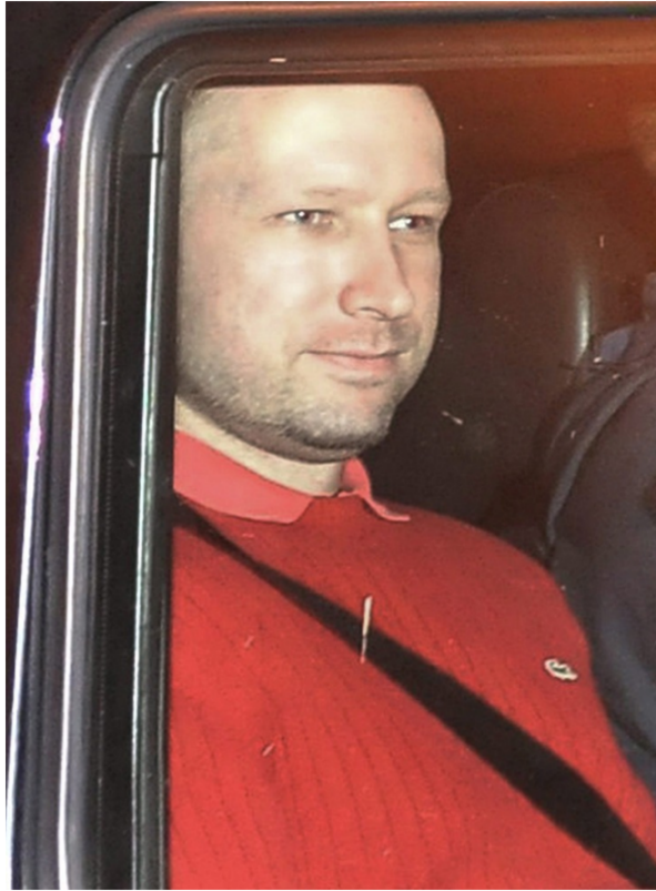
Breivik under arrest

There is no evidence that Unabomber's actions, or the two assassination attempts against President Gerald Ford (by Lynette Fromm and Sara Jane Moore) were deep events in this second, more limited sense. The still not understood nerve gas attacks of 1995 in the Tokyo subway, by the Buddhist group Aum Shinrikyo, can be seen as a possible deep event. 2 The attack on Pope John Paul II is a more probable one, because of the murderer's membership in the Turkish Grey Wolves, an activist movement close to the Turkish security apparatus now known as Turkey's gizli devlet or deep state. 3