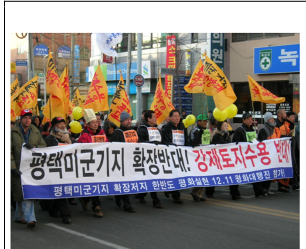
Peace march in downtown Pyeongtaek with international activists.

frequent, favorable coverage. Hankyoreh 21 , the weekly magazine produced by the same media company devoted a section each week to Daechuri residents and KCPT's campaign.