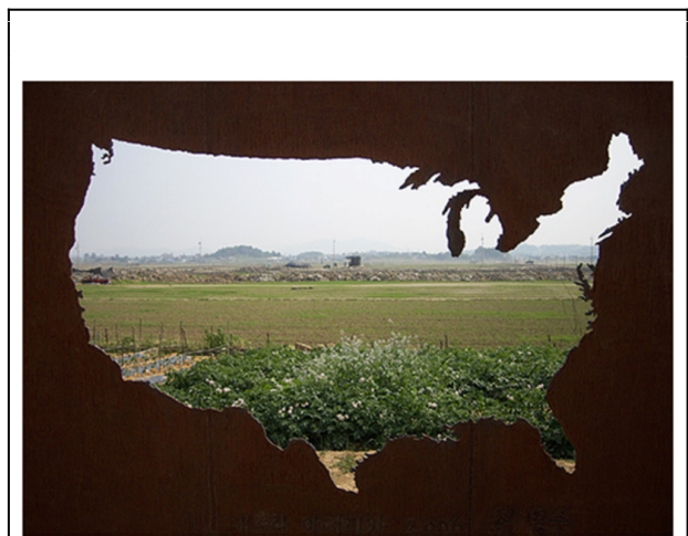
Daechuri Village in Pyeongtaek

In April 2003 the South Korean and U.S. government formally announced the decision to relocate Yongsan Garrison to Pyeongtaek. The Ministry of National Defense (MND) also announced its plan to expropriate land surrounding Camp Humphreys for base expansion. Of the designated base expansion land, the MND planned to acquire 240,000 pyeong (about 199 acres) of land from Daechuri village.