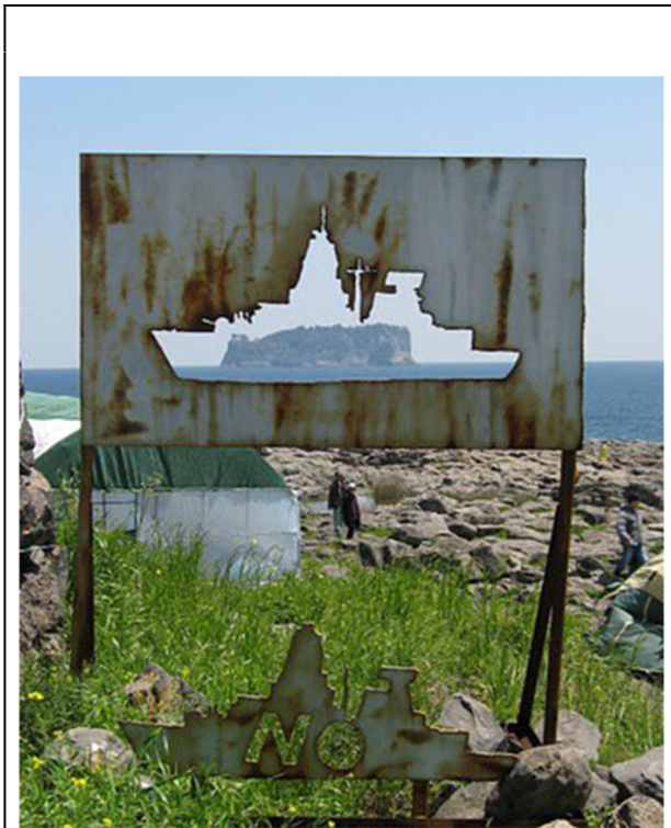
Jeju Anti-base Movement

movement episode in Jeju develops. There are of course the superficial resemblances such as the consecutive days of candlelight vigils, the large tent structure serving as a base of resistance, or the sit-ins and demonstrations blocking construction workers followed by arrests. However, two more significant parallels are worth noting as activists enter an intense phase of anti-base activities. First are the types of frames employed by the movement as local residents and South Korean and international activists attempt to converge on common ground in solidarity. The second is the response from the South Korean government.