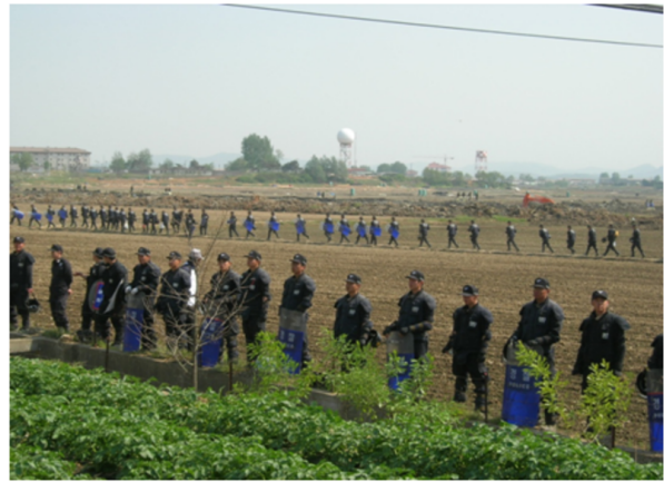
Riot police outside Camp Humphreys in Pyeongtaek

However, by April 2006, the MND had shifted from its tactic of delay and foot-dragging to one of resolution and force. One month earlier, MND workers were sent to Daechuri to dig a trench and erect barbed wire around the expanded base area to prevent residents from continuing their farming. However, MND workers aborted their plan as several hundred protestors set fire to fields and physically took over two of the backhoe tractors used to dig trenches. 42 Thus in early April 2006, Defense Minister Yoon stated, “The delay in base relocation is coming close to a point where it may create a diplomatic row with the United States. Therefore, from here on out, we will strengthen our possession over the designated base land.” 43 The following day, the MND posted an article on its website titled, “Delay in Pyeongtaek base relocation may ignite a diplomatic problem.” The article outlined reasons why the process was being delayed and its impact on the national interest. 44 A few days earlier on April 8, the MND had sent 750 riot police to begin filling in the farmers’ rice irrigation system with concrete. The MND blocked the irrigation canals to prevent residents’ attempts to continue farming. Protestors fought riot police and prevented workers from destroying two canals, but workers managed to fill in at least one canal with concrete. 45