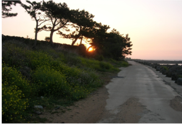
Sunrise along coastal road on Jeju Island

The third frame elicits democratic rights and justice, pointing to the lack of transparency and fair representation of those citizens affected by the new base. The first and third frame employed by Jeju activists are nearly identical to those used by Pyeongtaek activists six years earlier. However, to most Koreans, it is likely the second frame which would have the largest appeal. As a friend in Jeju commented, the thought of a military base coming to Jeju does not leave her with a good feeling. This may be the majority opinion of most Jeju citizens. However, these “thoughts” have not yet led to greater island-wide protests as in Okinawa where resistance to the proposed Henoko base expansion has defied the US-Japan plan for more than a decade. Many residents opposed in principle are also ambivalent about taking political action. In addition to building international solidarity, then, activists will need to build frames to mobilize ambivalent Jeju residents from the sidelines to build a cascading effect. There is no guarantee that the South Korean government will heed the majority will, but given that the naval base being built is a South Korean base, Seoul will feel more pressure from its own citizens.