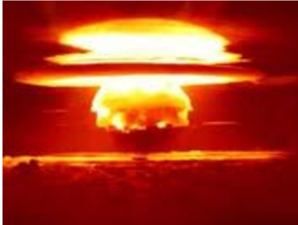
The Bikini blast

The ocean at night, dyed the colors of sunset, then the rumbling, and—two hours later—the white ash falling: I felt as if I had experienced it along with that young man and wanted to visit him in the hospital and hear from him firsthand. But when I boarded the train, I became absorbed in that persimmon-bound book.