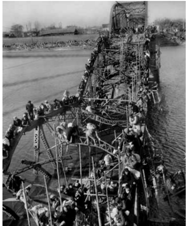
Refugees Fleeing across the Han River, 1950

In the early stages of the Korean War, the South’s porous defensive efforts and misguided measures of an inexperienced government resulted in North Korea’s occupation of numerous South Koreans, who were forced to comply with orders of the Northern troops. The chaotic situation was worsened by the South Korean government’s bold pronouncements early on, only to find itself hastily abandoning Seoul shortly thereafter. Many of the people who did not escape the sudden onslaught suffered from such atrocities as massacre, torture, imprisonment, and abduction, while those who survived were often branded “collaborators,” leaving them with a permanent black mark. The so-called background checks, which were rigorously enforced through the 1980s, served as a de facto guilt-by-association system that did not allow suspected individuals to assume public office.