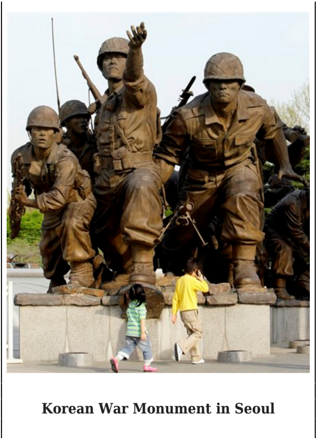
Korean War Monument in Seoul

The Korean War, which began with North Korea's surprise invasion of South Korea on Sunday, June 25, 1950, lasted for three years. The hostilities ended with the signing of an armistice agreement in July 1953. This war broke out only five years after the Korean Peninsula had been liberated from Japanese colonial rule, and only three years after the establishment of separate North and South governments, in a nation divided by foreign powers. The war's devastation left much of South Korea in ruins, along with its people in social turmoil. Sixty years hence, South Korea now strives to play a central role in resolving the common problems of the global community, as evidenced by its hosting of the G-20 Summit in Seoul, in November 2010.