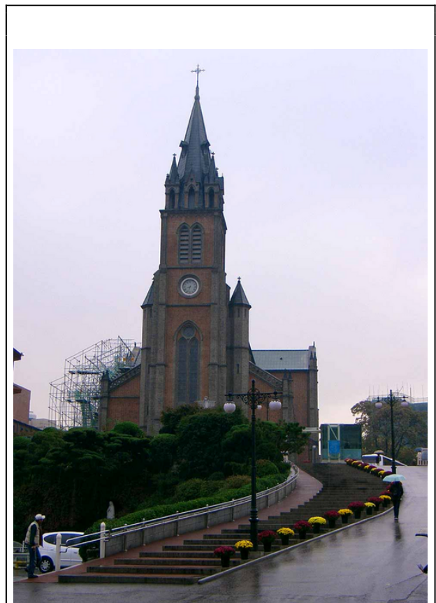
Myongdong Catholic Cathedral in Seoul

the military personnel and POW detainees as well. It has been noted that the Christian leaning administratin of President Syngman Rhee’s also served to promote its acceptance among the general populace. Christianity was seen as a means to obtain relief supplies, as well as a pathway to the United States and a way to taste a piece of the American lifestyle in Korea. With so many Koreans relying on the church for food aid, the United States came to be stamped indelibly into the minds of Koreans as a “land of grace.” There are scholars who trace a tendency among Christian circles, to believe that material blessings will naturally follow from a belief in Christ to people’s experiences of the war and its aftermath.