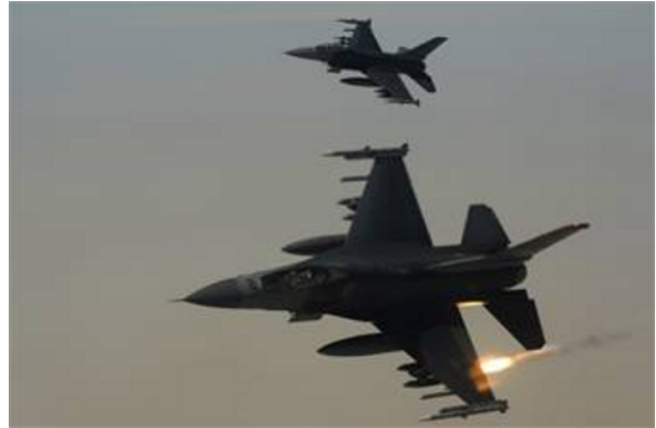
USAF F-16 Fighting Falcons over Iraq on Feb 17, 2009

Today, a vague anxiety hangs over many people in Misawa. This is the fear that some day American planes might disappear from the scene. There are 40 F-16 jet fighters assigned to Misawa, but around 10 of them have been dispatched to Iraq, and 15 others were temporarily dispatched to South Korea in May. Fewer than half of the planes remain in Misawa. Of course, this reduction has had an impact on the local economy.