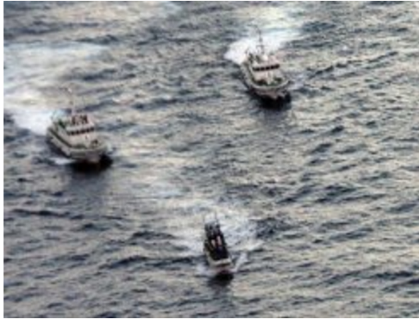
Two Japanese Coast Guard boats pursue a Chinese trawler

Qixiong and the provocative assertion that his case would be adjudicated under Japanese domestic law, rather than resolved through quiet diplomacy between Tokyo and Beijing.