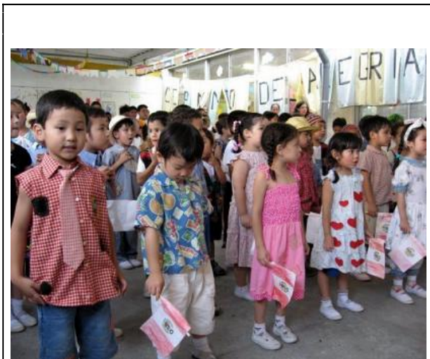
Immigrant children in a suburban Tokyo school celebrate Peru’s independent day