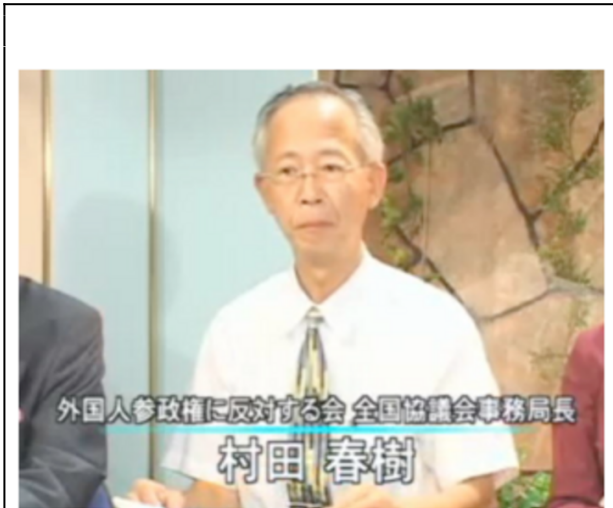
Murata discussing his views opposing foreigner voting rights.

Japan-based Koreans. 4 Their agenda is consistent: to “correct” interpretations of recent Japanese history that they deem to be unpatriotic. These presentations thus supplement other efforts by Japanese determined to write a “new history” that instills national pride to replace the shame-ridden interpretations of Japan’s colonial and wartime history. 5