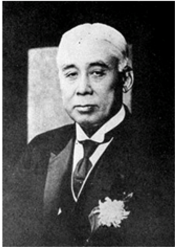
Hara Takashi, Japanese Prime Minister (1918-1921)