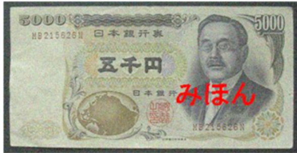
Nitobe Inazō, Educator, appeared on Japan's 5000 yen bill