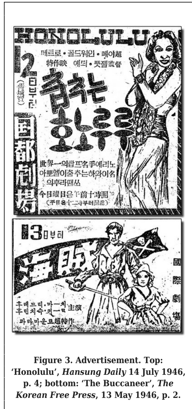
Figure 3. Advertisement. Top: 'Honolulu', Hansung Daily 14 July 1946, p. 4; bottom: 'The Buccaneer', The Korean Free Press , 13 May 1946, p. 2.

Buccaneer (1938), The Rains Came (1939), Golden Boy (1939), Honolulu (1939), The Under Pup (1939) and Abe Lincoln in Illinois (1940). These were 'prestige pictures' in the sense that they were 'injected with plenty of star power, glamorous and elegant trappings, and elaborate special effects' (Balio 1995, p. 180) - attractive packaging for presenting some of the core democratic reform values that the US government wanted for Korea. 31