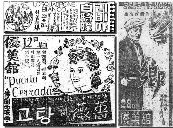
Figure 2. Advertisements. top: 'The White Squadron', New Corea Times 21 December 1945, p. 2; bottom: 'Puerta Cerrada', Hansung Daily 14 December 1946, p. 2; side: 'Pépé le Moko', Hansung Daily 27 October 1946, p. 3.

Leftist entrepreneurs also stepped in to fill the gap in control of the film scene. Before USAMGIK had begun in earnest to assist the US film industry to spread 'American' views of so-called democracy and modernity via the exhibition of Hollywood films, other organizations such as the left-wing Chosun Film Federation (hereafter CFU) began holding screenings of Soviet feature films. In the early post-war period, CFU had stimulated debate in southern Korea about Korea's political and social future by screenings of films, such as Sergei Eisenstein's Ivan the Terrible (1944), as well as Soviet newsreels (Armstrong 2003). They too were interested in developing new cultural ideas and attitudes that could help Korea move away from the militaristic ideology of the former Japanese colonial government. 24 Yet, their activities were strongly opposed by the USAMGIK authorities - particularly given the proximity of Soviet forces in the northern part of Korea. 25