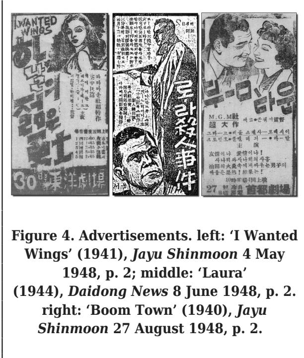
Figure 4. Advertisements. left: 'I Wanted Wings' (1941), Jayu Shinmoon 4 May 1948, p. 2; middle: 'Laura' (1944), Daidong News 8 June 1948, p. 2. right: 'Boom Town' (1940), Jayu Shinmoon 27 August 1948, p. 2.

Based on advertisements in Korean that appeared regularly in major local newspapers, a majority of the films screened at this time were talkies produced between the mid-1930s and early 1940s. Action-adventure and historical bio-pics were prevalent, followed by melodramas, screwball comedies, musicals, westerns, crime/detective thrillers, science-fiction and animated cartoons. 32 These advertisements attempted to lure audiences with arousing drawings and silhouettes of film stars, action scenes and exotic locations, promoting all the glamour of American culture. They depicted dashing portraits of leading Hollywood stars including Robert Montgomery, Judy Garland, Bing Crosby, George Raft, Eleanor Powell, Richard Dix, Clark Gable (about to kiss Claudette Colbert in Figure 4 below) and Jean Arthur as a feisty cowgirl in Arizona (1940).