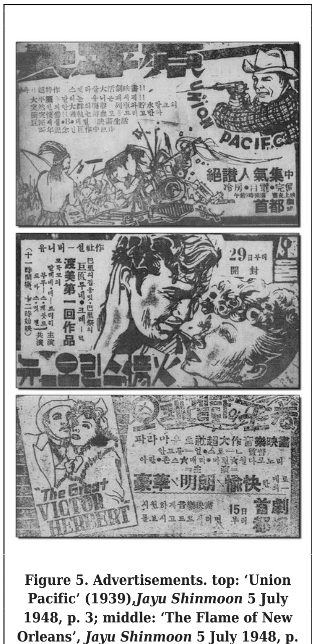
Figure 5. Advertisements. top: 'Union Pacific' (1939), Jayu Shinmoon 5 July 1948, p. 3; middle: 'The Flame of New Orleans', Jayu Shinmoon 5 July 1948, p.

exploration and desire for material wealth, as well as jealousy and rivalry over women, and social mobility. These are all themes that would have appeared in striking contrast to the colonial ideology of the Japanese occupation, let alone the pre-colonial values to which Korean audiences were accustomed. At the same time, the graphic imagery of the advertisements attracted non-Korean-speaking US troops as well - a welcome secondary audience.