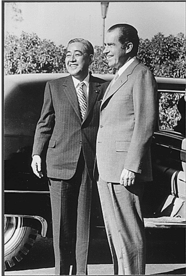
Sato and Nixon, 1972

Following the reversion, Japan from 1978 began to pay regular and continuing sums to subsidize the Pentagon, a peculiar form of “reverse rental” (by landlord to tenant) that came to be known as “ omoiyari ” (sympathy) payment in Japanese and “Host Nation Support” in English. The annual sum grew steadily, from 6 billion yen in 1978 to around 200 billion yen (more than $2 billion) today, with “indirect” items included, Japan’s subsidy in total amounted (according to the US Department of Defense in 2001) to an annual $4.4 billion. 27 Over slightly longer than three decades, it amounts to approximately three trillion yen, roughly 35 billion dollars. 28 That is about three times as much as NATO and about one half of the entire world’s subsidies to maintain the US military presence. Where