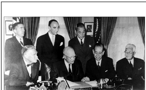
Eisenhower with Kishi and Fujiyama (right)

which Tokyo District Court Justice Date Akio held US forces in Japan to be “war potential” and therefore forbidden under the constitution’s Article 9 (the peace commitment clause). Had the Date judgement been allowed to stand, the history of the Cold War in East Asia would have had to take a different course. At 8 am on the morning immediately following it, however, and just one hour before the Cabinet was to meet, US ambassador Douglas MacArthur 2 nd held an urgent meeting with Foreign Minister Fujiyama Aichiro. 4 He is known to have spoken about the possible disturbance of public sentiment that the judgment might cause and the complications that might ensue. Following that meeting, the appeal process was cut short by having the matter referred directly to the Supreme Court, and MacArthur then met with the Chief Justice to ensure that he too understood what was at issue. In December 1959 the Supreme Court reversed the Tokyo Court judgement, ruling that the judiciary should not pass judgement on matters pertaining to the security treaty with the US because such matters were “highly political” and concerned Japan’s very existence.