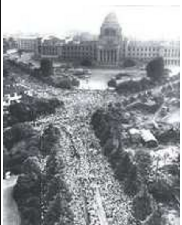
Demonstrators surround the Diet in an attempt to bloc the Ampo Treaty

The 1960 adoption of Ampo was tumultuous. The government at the time was that of the Liberal Democratic Party (LDP), which had been set up in part with CIA funds five years earlier and in character and inclination owed much to American patronage. It was headed from 1957 by Kishi Nobusuke, the US’s preferred agent, who had been installed as Prime Minister in 1957. Kishi rammed the bill through the House of Representatives in the pre-dawn hours on 20 May, in the absence of the Opposition, as protesters milled about in the streets outside.