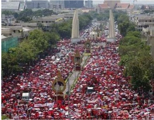
Red shirt protest in Bangkok