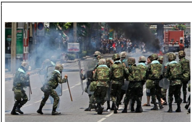
May 14, Thai forces move against protesters

As I write, the military has at last unleashed its terrible power and reports from Bangkok suggest the city is being turned into a bloody war zone.