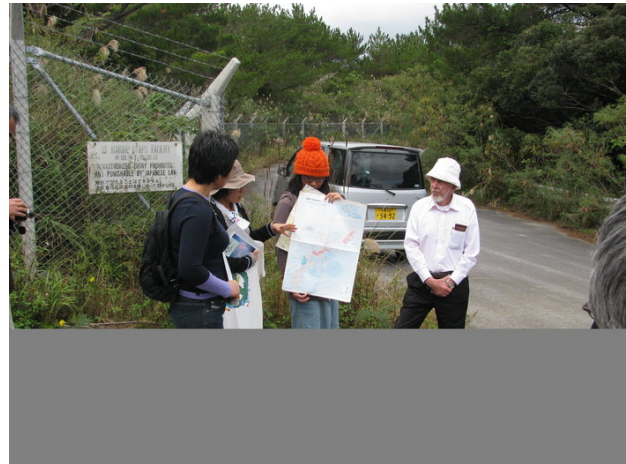
Author being briefed at the site of the Helipad Sit-In, Higashi village, Yambaru, Okinawa, 6 December 2009.

dual-runway and military port project of 2006, and having experienced the emptiness of the promise of economic growth in return for base submission, Okinawans were in no mood to be tricked again.