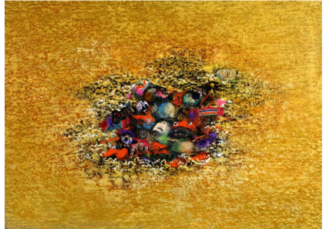
"Adrift II," a 2008 oil painting by Tomiyama Taeko (trimmed).

Nonetheless, while these visitors admired her images, they often missed much of Tomiyama’s specific social commentary. Tomiyama draws on many Japanese and pan-Asian folk symbols and historical references, whose meaning are not immediately apparent to people unfamiliar with modern Asian history and culture. Her foxes may look cute but they are dangerous. When I showed her paintings to my students, the more I explained, the more they were engaged by what they saw. As I read through the visitors’ book in the exhibit, I found only a single entry that cut to the heart of Tomiyama’s visual symbolism, but that one comment rocked me back on my heels. “I am a survivor of torture. Thank you for your work. Telling the truth exposes the foxes.” Because of that visitor’s words, together with my students’ reactions, I decided to introduce Tomiyama more fully to English-speaking audiences through an edited book (with Rebecca Jennison), 3 a website of Tomiyama’s work hosted at Northwestern University Library , and now this lively and engaging interview with Tanaka Nobuko of the Japan Times .