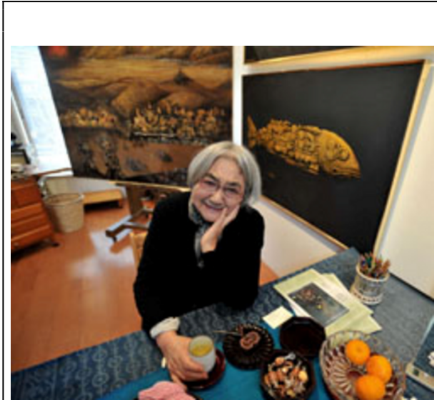
In 1995, she was invited to exhibit as a Special Guest at the first Kwangju Biennial Art Festival in South Korea, in honor of her many artworks based on the bloody, prodemocracy Kwangju Uprising there in 1980. Then, in 1998, she received the Women's Human Rights Special Award from The Foundation for Human Rights in Asia.

has, over her long career, had many excellent reviews for her exhibitions outside Japan, notably in London, Berlin, Paris, New York, Bangkok and Melbourne.