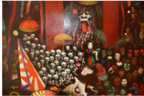
"The Night of the Festival of Garugan" (1988), an oil by Tomiyama Taeko (trimmed).

Consequently, most of my exhibitions have been held in European countries, the United States and South Korea, because in those places there were no problems at all in showing my social-issue paintings and prints.