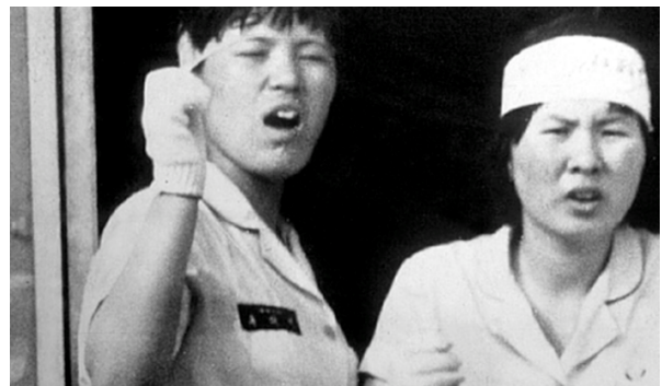
"Money for our backbreaking work... Money that Never Comes." [Still from Light of a Factory, DVD version, 2006, Hakchon Music]

In 1979, Kim Min Gi and other activists from South Korea's democracy and labour movements clandestinely released the collective radio play "Light of a Factory" ( Kongchang'ui Bulbit ). This work was used to mobilize factory workers into the broad-based minjung or people's movements that were challenging the dictatorship. The play documented the lives of Korean workers and the suppression of their desires under the authoritarian regime. The plot centered on female workers in an export factory who decide to organize a union. It was loosely based on real struggles such as the massive strike by female employees at the Y.H. Trading Company in 1978-9; a strike which spilled over into the struggles of the Korean democracy movement. The music was a cacophony of different styles and influences: from US camptown progressive rock, to Western and Korean folk music, to shaman ritual and other traditional styles. Cassettes of the play were rerecorded on home stereos and passed around from hand to hand.