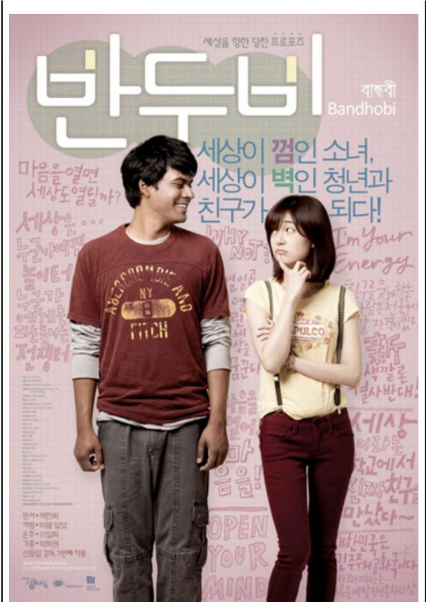
Promotional Still from the 2009 movie Bandhobi , subtitled trailer available here .

In a curious way, the deportation of undocumented and politically active migrant workers has actually helped to spatially expand the scale of the migrant struggles, creating a transnational dimension to Korean migrant activism that was non-existent before. 39 That a film like 'The Deported' has been made at all speaks to the growing connections between Korean civil society, migrant workers, and foreign-born residents. The film and the movement also touch upon the growing phenomenon of transnational marriages between migrants and Koreans, which is set to further reconfigure the politics of citizenship in Korean society. The filmmaker, Mustaque Ahmed Mahbub, is married to a Korean national and thus, unlike most migrants, he was