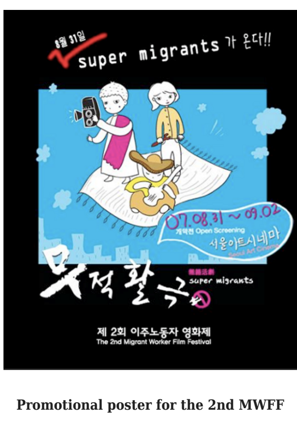
Promotional poster for the 2nd MWFF

Although other festivals in Korea and elsewhere occasionally cover migrant workers' issues, the MWFF is unique in that it focuses exclusively on a broad range of topics specifically related to migration. Through documentaries, comedies, dramas and other genres, audiences are introduced to films that show how migration intersects with issues of labour, human rights, race, education, culture, and gender. Numerous amateur productions by first-time Korean or migrant directors are screened alongside international or domestic feature length films. Through the screening of films, and the cultural performances and parties that are also part of the MWFF, this traveling festival expands the discussion about migration beyond what is possible with MWTV's regular programs.