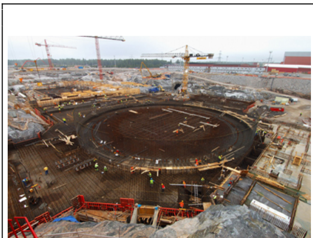
AREVA's troubled Olkiluoto 3 reactor development in Finland.

In addition to the direct economic benefits there could be trickle-down effects throughout the wider economy. UAE officials have stressed that 60% of the workforce to operate the plants will be Emirati nationals who will be trained both overseas and at Abu Dhabi's Khalifa University. This should also lead to the development of specialised human resources in other areas, and should greatly spur the diversification of the Emirates economy away from a reliance on oil exports. The agreement calls for the first phase of the scheme to start delivering nuclear energy by 2017, with the four plants eventually meeting up to 25% of the country's electricity needs after 2020 when all are scheduled to be operational.