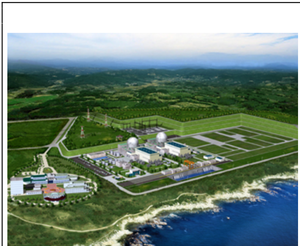
An artist's impression of South Korea's Shin-Kori 3 and 4 reactors

enable Korean firms to meet the Ministry of Education, Science & Technology's target for the country to develop its nuclear industry into one of the world's top five by 2011, and allow it to compete even more forcefully in the global market.