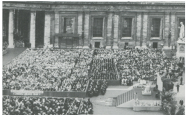
The papal Mass in St. Peter's, 22.5.80

There is a context to the concern expressed by the two post-war pontiffs for the Japanese war criminals. The context is provided by a document styled Pluries Instanterque , issued by the Society for the Propagation of the Faith ( Propaganda Fide ) in 1951. Or rather, it was re-issued in 1951, for its origins go back to 1936. Pluries Instanterque was the Catholic Church's response to the prewar dilemma in which Catholics found themselves, when required by their university, say, to visit Yasukuni and other shrines, and makes acts of obeisance. The Catholic Church's position had been that Catholics' participation in shrine rites of any sort was unacceptable, and this in turn had led to the infamous Sophia University incident of