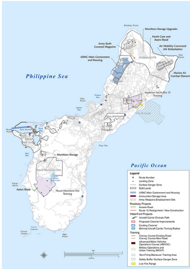
Proposed Military Buildup in Guam (from Joint Guam Program Office, United States Navy, Proposed Action/Guam )