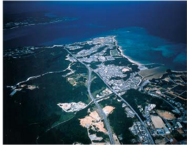
Camp Schwab, Eastward to Henoko Point and Oura Bay.

The “Roadmap” was a follow-up to the December, 1996 Japan-U.S. Special Action Committee on Okinawa (SACO) agreement which promised to return “approximately 21 percent of the total space of the US facilities and areas in Okinawa excluding joint use facilities and areas (approx. 40 square kilometers),” including the MCAS Futenma and a large portion of the 50 square kilometer Northern Training Area. The closure/return of each of the facilities/areas was contingent on relocating most of their functions within Okinawa. The MCAS Futenma, for example, would be returned “within the next five to seven years” after a sea-based facility (SBF) was established off the Henoko peninsula near the Marine Corps Camp Schwab training complex on the northeastern coast of the main island of Okinawa. The floating base, connected to land by a pier or causeway, was chosen over two other alternatives—incorporating the heliport into the huge Kadena Air Force Base or building a heliport at Camp Schwab. The heliport, the two governments suggested, would enhance “safety and quality of life for the Okinawan people while maintaining operational capabilities of U.S. forces and could be removed when no longer necessary.”