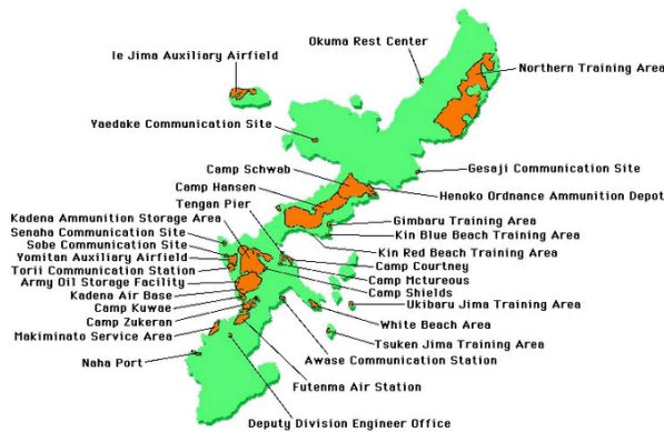
Okinawa Prefectural Government, U.S. Military Bases in Okinawa (2004)

The U.S. Department of Defense chose the American territory of Guam for the Marine relocation from Okinawa from geopolitical and strategic perspectives, saying: