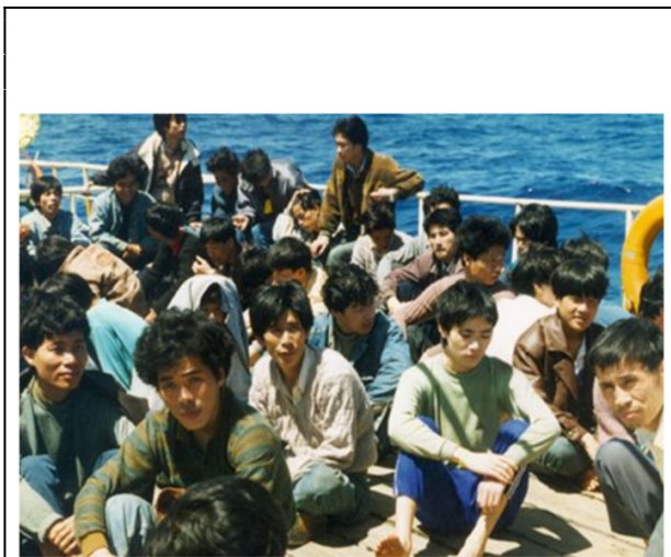
Fujian undocumented migrants on the deck of a fishing boat.

Accompanying payment for the visa, there were also extra costs was associated with pooling money. Only a few families already had members working abroad and therefore could afford the initial costs. Most immigrant families borrowed at high interest (usually 1 percent every month) or obtained loans through rotating credit associations. Many Fujian students had to quit school and become visa-overstayers because of the financial burden.