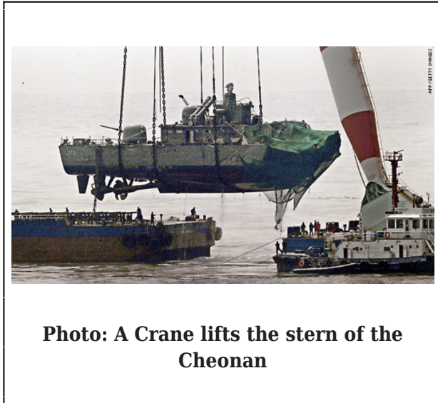
Photo: A Crane lifts the stern of the Cheonan

of the South Korean defense ministry, since the ministry controlled its release on May 20 and since then has handled official presentations.