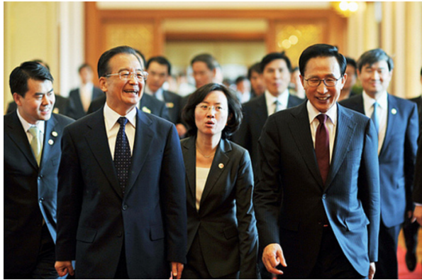
Photo: Chinese Premier Wen Jiabao, left, met with South Korean President Lee Myung-bak, right, and Japan's Prime Minister Yukio Hatoyama, unseen, on Jeju Island on May 29 & 30. At a joint press briefing Wen said: "What is most urgent for now is to reduce the tensions from the Cheonan incident and especially avoid a clash."

Premier Wen Jiabao has talked about judging the Cheonan incident in an "objective and fair manner" and based on the facts. The US and South Korea have dropped strong hints that the 5-page JIG statement is compelling and China does not need to wait. Both want China to act "responsibly."