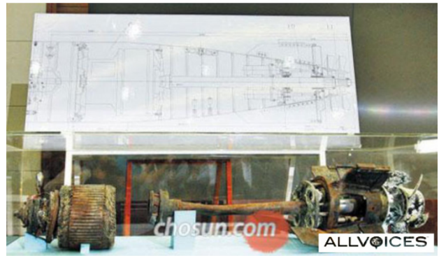
Photo: South Korea's Defense Ministry displays the motor and running gear of the torpedo alleged to have hit the Cheonan.