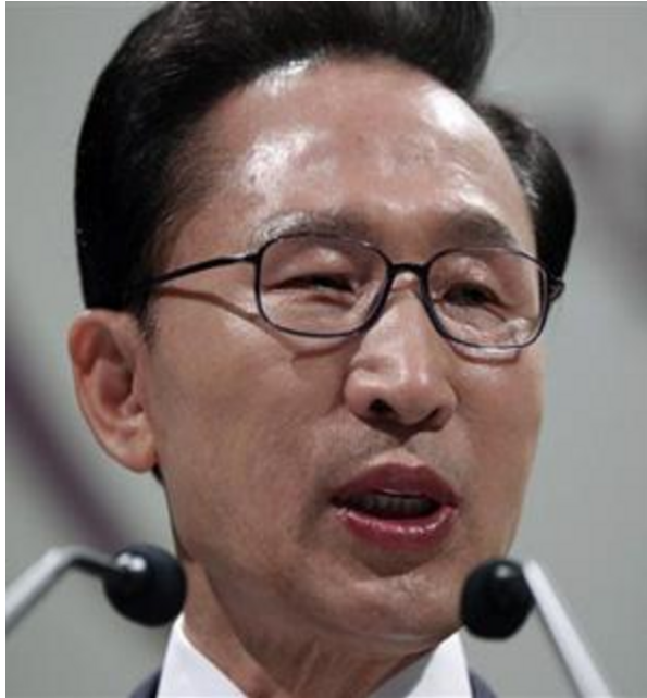
Photo: South Korean President Lee Myung-bak