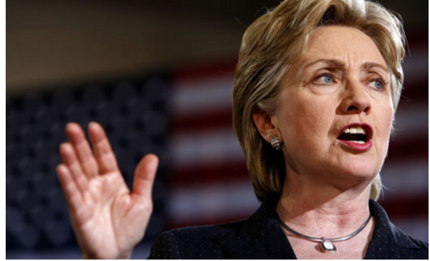
U.S. Secretary of State Hillary Clinton

Immediately after the 5-page statement's release Hillary Clinton intoned "provocative actions have consequences" and "the international community" "cannot allow [North Korea's] attack on South Korea to go unanswered."