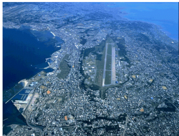
Aerial view of densely populated Ginowan City, with Futenma Air Station occupying 25% of the city's land.

my submissions. The Futenma Problem has really become a problem for the government, but the issue has tended to be one of whether or not to move the base to Henoko. However, although the U.S. government has been steadily moving ahead with plans to move the Futenma Marines to Guam, and the Japanese government is spending $6 billion towards funding the move, the Japanese people and Diet, and the people of Okinawa, have never been given a proper explanation of these plans. In the U.S., various documents, including an Environmental Impact Assessment on the relocation of the base to Guam, have been made public; I want to make this known in detail in Japan. The problems surrounding Henoko and U.S. bases within Okinawa Prefecture should be reviewed. The question is: why should a base be required in Henoko when most of the Marines in Okinawa are being relocated to Guam, and the Futenma Base itself is going to be moved to Guam.