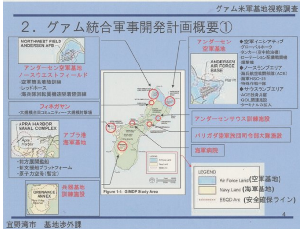
A Map of Guam from the Guam Integrated Military Development Plan, translated and analyzed by Ginowan City

This plan has been around for three years. Now the environmental assessment has been done and the Environmental Impact Statement issued. Once revised in accord with opinions received, the plan will, if approved, then be implemented. Approval is anticipated by July 30, 2010.