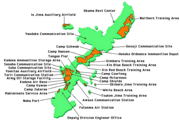
U.S. Military Facilities on the main island of Okinawa (from the website of Okinawa Prefecture)

unacceptable. This is the greatest opposition, and this is why relocation within the prefecture has been opposed so strongly