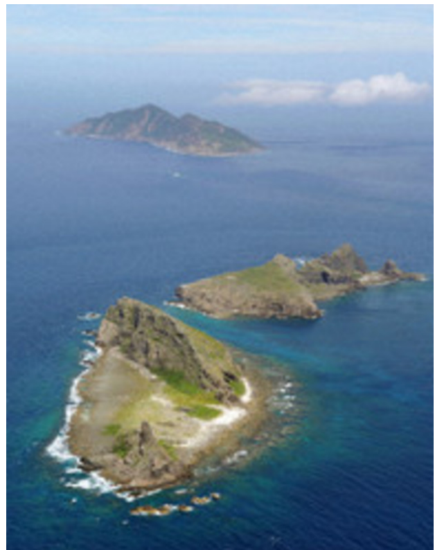
• Picture 1: Minamikojima (foreground), Kitakojima and Uotsuri islands, part of the Japanese-controlled Senkaku Islands.

exclusive sovereignty and control over the islands.