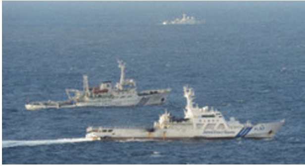
Picture 2. The Japan Coast Guard patrol vessel Yonakuni (foreground) and the Chinese maritime surveillance vessel Haijian 137 sailing in parallel in waters 38 kilometers north of Uotsuri Island, at 5:40 p.m. on Jan. 21, 2013.

Japan has repeatedly denied the existence of any dispute over the sovereignty of the islands in order to avoid being forced to negotiate with China and Taiwan, and therefore to preclude having to make concessions that would weaken its effective administration of the Senkakus and surrounding waters.