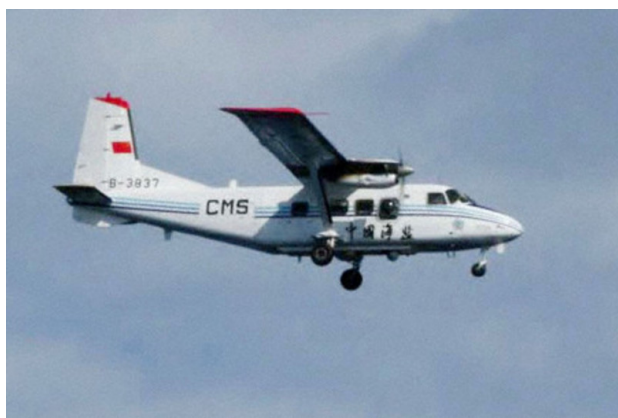
Picture 6: Chinese surveillance airplane entering Japanese airspace near the disputed

Senkaku islands shortly after 11 a.m. on Dec.13, 2012, in the first such intrusion.