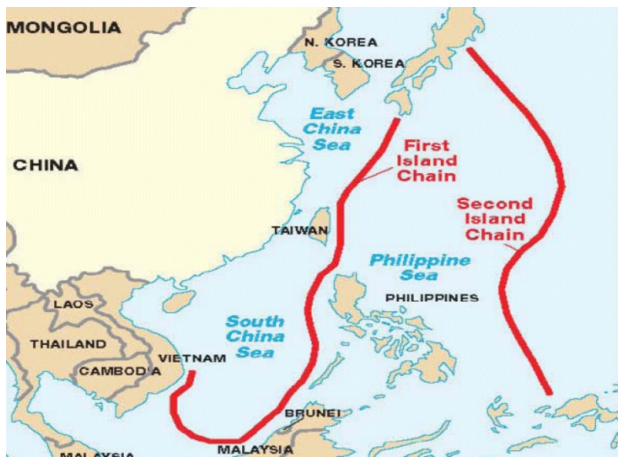
Picture 5: Graphic representation of the First and Second Island Chains.

China is pursuing two objectives in the current dispute. The first, diplomatic, is the recognition by Japan that a dispute over the sovereignty of the Senkakus exists. The second, strategic, is to weaken the so-called First Island Chain, seen by some in Beijing as containing China's growing maritime power, while expanding its territorial waters and exclusive economic zones. 6