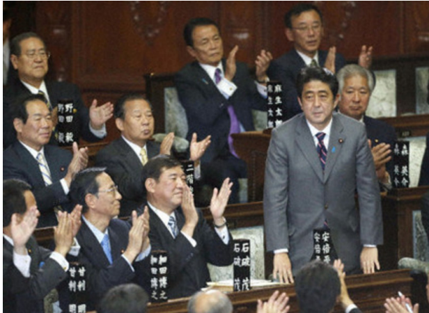
Picture 3: Liberal Democratic Party president Abe Shinzo bows after being elected as new Prime Minister during a plenary session of the Lower House in Tokyo on Dec. 26, 2012.