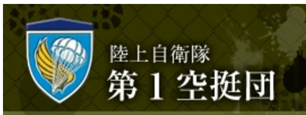
Picture 10: Emblem of the 1 st Airborne Brigade, Self-Defense Forces' elite paratroopers.

The increasing militarization of the region, with the Senkakus as one of its focal points, suggests that the dispute will periodically erupt again if not definitively settled. Shelving it