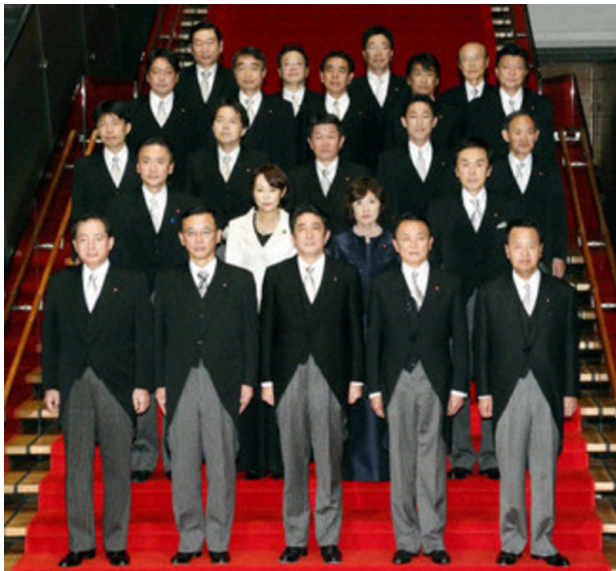
Picture 4: Japan's new Prime Minister Abe Shinzo (front C) and members of his Cabinet after their first Cabinet meeting in late evening of Dec. 26, 2012.

One danger the new cabinet faces during the next few months preceding the Upper House elections is the reaction of financial markets.