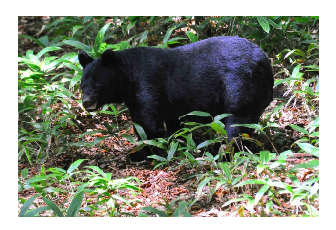
A Japanese black bear in the mountains of

Maita had come face to face with the strange reality of contemporary Japan: although it is among the most heavily forested countries in the world, much of it has become uninhabitable for bears and other wildlife. Sixty years of development and urbanization have reshuffled ancient patterns of land use and radically changed the composition of Japan's forests. Habitat for ordinarily shy mountain wildlife has shifted closer to villages, causing conflict with humans to increase.