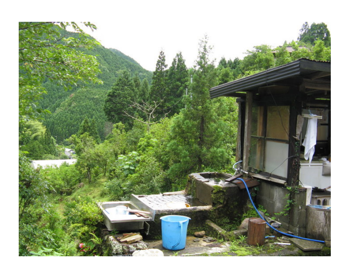
Overgrown fields and abandoned houses, like this one in a village in Mie Prefecture where just two residents remain, are a common sight in rural areas.

"Bear management consisted of killing bears," says Maita. That is still the case in many areas where the animals are not officially endangered. Sport hunting of Asiatic black bears, which is legal only in Japan and Russia, is declining and now accounts for about 500 bear deaths each year<sup>21</sup> (killing bears for their gall bladder is also still permitted in Japan). Nuisance kills are a far greater threat and account for 1,000 to 2,000 deaths per year on average.<sup>22</sup> Many villagers see bears as pests, says Maita, or simply don't know what to do when a bear appears in their back yard. Although Japan's black bears kill humans only in extremely rare cases, many people have little knowledge of their behaviour. Standard practice until recently had been to call the local government, which would call a hunter and have the animal killed. Even in protected areas "problem bears" can still be dealt with in this way. And for local officials who, thanks to a 1999 change in wildlife management law, now have final say on how bears are handled, the perception that in some areas numbers are increasing only bolsters their image as a pest to be controlled.