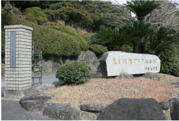
A view of the front gate at the Aso-Iizuka Golf Club, of which former Japanese prime minister Taro Aso is chairman. (Kim Hyo Soon)

were simply buried in the ground. Even if there was an intention to cremate them, the high price of coal resulted in their effective abandonment.