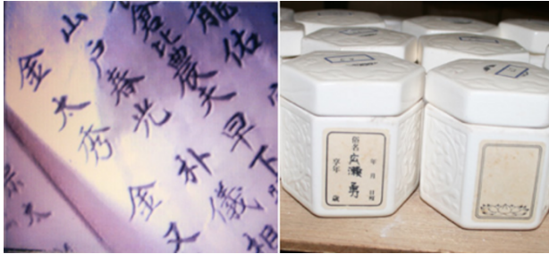
Korean names that were on urns in the “Senninzuka” ossuary (left) were replaced by numbers when the urns were transferred to Kinshoji temple (right).