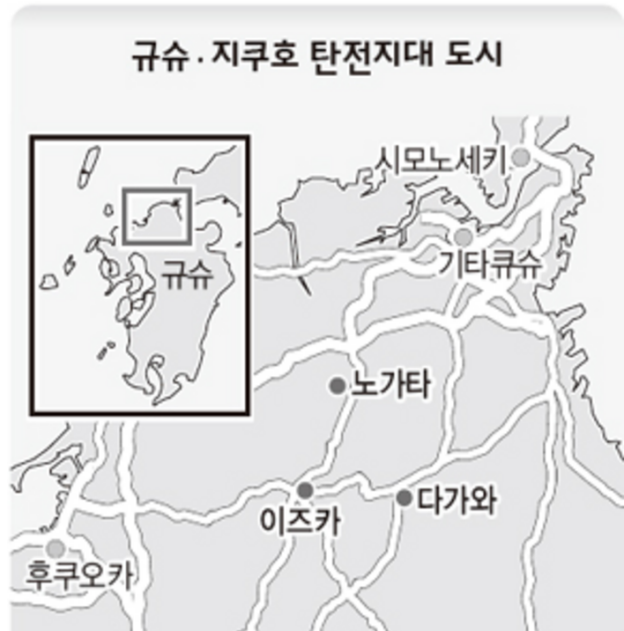
Korean map of the Chikuho region of Kyushu, Japan

be filled up for safety reasons when the mine was shut down. The Hoshu Mine, where a residential area stands today, is a placer mine where the shafts descend obliquely. They go down a full kilometer, and it is said that it took a miner 30 minutes to walk down and another hour to come back up. After the mine was shut down in 1945, its coal exhausted, it stayed alive for rescue training purposes.