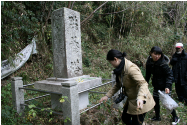
Staff members of the Oka Masaharu Memorial Nagasaki Peace Museum clean the “Senninzuka” memorial tower, which originally contained an ossuary underneath.

Korean Residents in Japan (Chongryon). It was in the midst of this controversy that the destruction of the inscription took place.