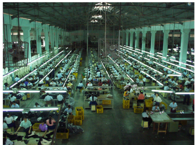
Women doing assembly work in a factory

There was a general sense that they provided some formal function, yet they did not provide any consistent sense of support in women's everyday working lives.